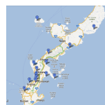
Map of Alleged Locations of Agent Orange on Okinawa ( link ( https://maps.google.com/maps/ms?hl=LTFR&ms=0&mid=2183279372728092250.0004387%3D3664309761+-m40-26.44948,127.95082&sp=0.5122643,9677&source=embed )

Suggestions that these poisonous substances were widely used on their island have worried Okinawa residents. Stories about the usage of Agent Orange have repeatedly made the front page of Okinawa Time and Ryukyu Shimpō as well as becoming the basis of four TV documentaries - including the award-winning Defoliated Island an English version of which is viewable here ( http://www.japanfocus.org/events/view/163 )).