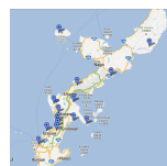
Map of Alleged Locations of Agent Orange on Okinawa ( link ( https://maps.google.com/maps/ms?hl=LTFR&ms=0&mid=2183279172728092251.0004387%3D3164330761+-m41-26.44948,127.95082&sp=0.512243.9677&source=embed )

Suggestions that these poisonous substances were widely used on their island have worried Okinawa residents. Stories about the usage of Agent Orange have repeatedly made the front page of Okinawa Time and Ryukyu Shimpō as well as becoming the basis of four TV documentaries - including the award-winning Defoliated Island an English version of which is viewable here ( http://www.japanfocus.org/events/view/163 )).