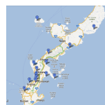
Map of Alleged Locations of Agent Orange on Okinawa ( link ( https://maps.google.com/maps/ms?hl=LTFR&ms=0&mid=2183279372728092250.0004387633166833097611-m401-264494832795082&sp=0.51226439677&source=embed ) )

Suggestions that these poisonous substances were widely used on their island have worried Okinawa residents. Stories about the usage of Agent Orange have repeatedly made the front page of Okinawa Time and Ryukyu Shimpō as well as becoming the basis of four TV documentaries - including the award-winning Defoliated Island an English version of which is viewable here ( http://www.japanfocus.org/events/view/163 )).