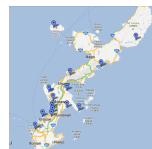
Map of Alleged Locations of Agent Orange on Okinawa ( https://maps.google.com/maps/ms?hl=LTFR&ms=0&mid=2183279372728092250.0004387%3D3668309761+-m40-26.44948,127.95082&sp=0.5122643,9677&source=embed )

Suggestions that these poisonous substances were widely used on their island have worried Okinawa residents. Stories about the usage of Agent Orange have repeatedly made the front page of Okinawa Time and Ryukyu Shimpō as well as becoming the basis of four TV documentaries - including the award-winning Defoliated Island an English version of which is viewable here ( http://www.japanfocus.org/events/view/163 )