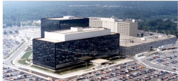
The National Security Agency, America’s largest intelligence agency, is also one of its least supervised.

August 2012 killed a respected moderate Yemeni cleric, along with the al Qaeda representatives with whom he was negotiating. 40