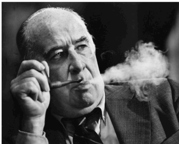
Attorney General John Mitchell authorized some illicit measures; but also, at Hoover's urging, he rescinded one, the so-called Huston Plan.

Among the most striking features of the PATRIOT Act was its resurrection of the long-discredited Huston Plan of 1970. The new bill permitted the FBI, CIA, and other agencies to engage in activities that had so horrified Attorney General John Mitchell that he convinced Nixon to rescind the plan four days after it was promulgated. Mitchell considered unconstitutional the Huston Plan's provisions for warrantless wiretapping, opening of mail, "black-bag" burglaries by U.S. agents, surveillance of various sorts, and preventive detention. 7