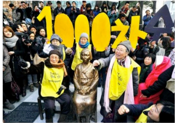
Comfort women in Seoul on the 1000 th demonstration in front of the Japanese Embassy.

2011 by the ROK's Ministry of Foreign Affairs and Trade (MOFAT) by refusing to negotiate, invoking the "treaty defense". MOFA insisted that all claims had been resolved by the 1965 Japan-ROK treaty normalizing relations. Then, during the Kyoto summit meeting in December 2011, President Lee, who had never raised the issue of comfort women, strongly demanded that Prime Minister Noda Yoshihiko settle the issue, which had recently gone viral in the electronic and print media in South Korea. Noda, who seemed shocked by this strong demand, rather than apologizing, counterattacked. He demanded that President Lee remove the bronze statue of a young girl seated across the road in front of the Japanese Embassy in Seoul. The statue was unveiled during a mass rally on December 14, 2011 on the occasion of the 1000 th weekly demonstration by the comfort women and their supporters. Lee immediately rejected Noda's demand and warned that second and third statues might be erected if Japan failed to resolve the issue. At present, the issue remains stalemated at a time when Japan-ROK relations are tense as a result of territorial conflict over ownership of the Dokdo/Takeshima islet.