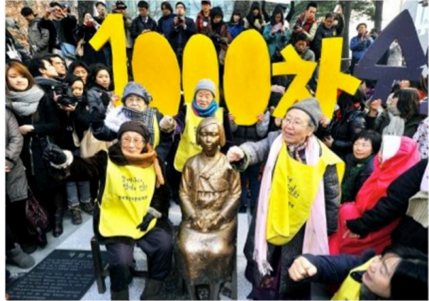
Comfort women in Seoul on the 1000 th demonstration in front of the Japanese Embassy.

2011 by the ROK's Ministry of Foreign Affairs and Trade (MOFAT) by refusing to negotiate, invoking the "treaty defense". MOFA insisted that all claims had been resolved by the 1965 Japan-ROK treaty normalizing relations. Then, during the Kyoto summit meeting in December 2011, President Lee, who had never raised the issue of comfort women, strongly demanded that Prime Minister Noda Yoshihiko settle the issue, which had recently gone viral in the electronic and print media in South Korea. Noda, who seemed shocked by this strong demand, rather than apologizing, counterattacked. He demanded that President Lee remove the bronze statue of a young girl seated across the road in front of the Japanese Embassy in Seoul. The statue was unveiled during a mass rally on December 14, 2011 on the occasion of the 1000 th weekly demonstration by the comfort women and their supporters. Lee immediately rejected Noda's demand and warned that second and third statues might be erected if Japan failed to resolve the issue. At present, the issue remains stalemated at a time when Japan-ROK relations are tense as a result of territorial conflict over ownership of the Dokdo/Takeshima islet.