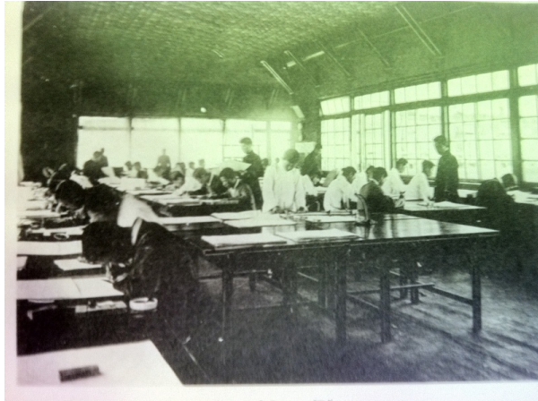
Figure 4. Employees of the Land Survey Bureau hard at work.

Once sufficient data had been acquired for each map sheet, draftsmen moved forward with a multistep process that involved the construction of a projection, the plotting of data points onto the map grid, the sketching of contour lines to convey topography, the demarcation of geographical points of interest through the representational code established in the map legend, and, perhaps most vexing of all, the inscription of toponyms, rendered with Japanese glosses (RTC 1918, 459–465). After numerous revisions, some of which necessitated further surveying and new data points, the map was near completion. Once a draft was approved it was printed and, depending on its security classification, sent to administrators and military officials who quickly put it to work (RTC 1918, 469). The first round of seventy-nine map sheets (such as figure 5) was printed in 1915; an additional 157, 261, and 242 sheets were printed in 1916, 1917, and 1918 respectively (RTC 1918, 469).