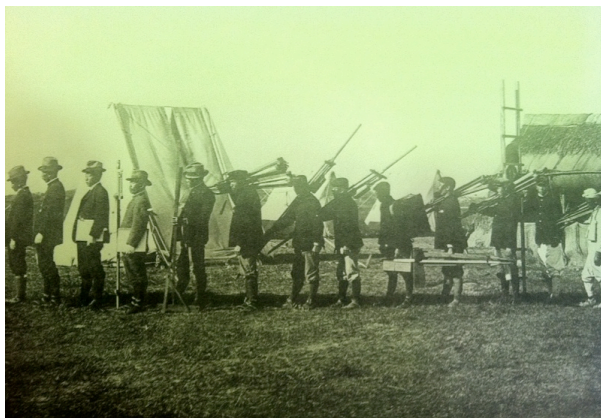
Figure 1. A surveying party gearing up for a day of fieldwork.

set at the scales of 1:50,000 and 1:25,000 (although other ratios were produced). This initial office work set out to prepare a basic skeleton of spatial information (e.g., latitudinal and longitudinal coordinates and basic toponyms) so that the surveyors could fluidly affix their measurements onto each original map sheet once the measurements started pouring in to field offices and drafting stations (Rinji tochi chosa kyoku [hereafter RTC] 1918, 454–455).