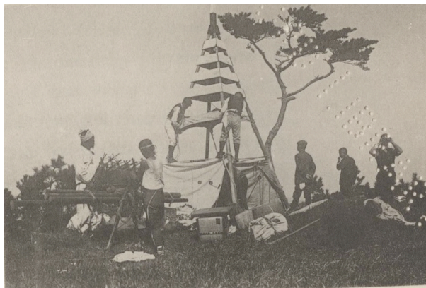
Figure 2. Surveyors constructing a signal pole atop a Korean peak.

In order to connect the geodetic triangulation of Japan proper with that of Korea, based upon the selection of principal points of triangulation in Tsushima island, Japan proper, the longitude and latitude of Zetsuyei (Chyolyong) island (near Fusan ) and Kyosai (Kö-jyö) island (near Masan ) in the extreme South of the Peninsula, and the distance between the two islands were surveyed (GGK 1911 43).