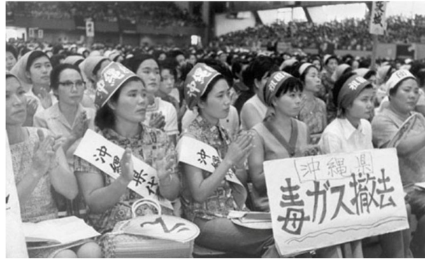
Poisoned ties: Okinawan women hold placard reading "Remove poison gas from Okinawa" at a Japan Mothers Association meeting in 1969 in Tokyo, just weeks after a poison gas accident at a U.S. installation on the island.

agents such as the ones Mohler described were ever present on Okinawa.