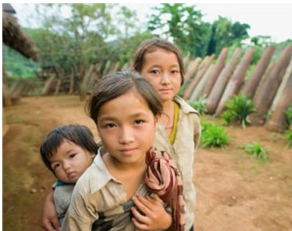
Millions of unexploded bombs remain in Laos