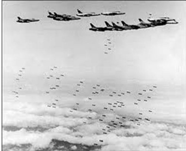
F-105 Thunder Chiefs in Rolling Thunder

Historian Jonathan Neale notes that “in most parts of North Vietnam, hospitals, schools and churches were the only brick or cement buildings of two stories or higher and pilots thought they were military barracks.” 32 Pilot Randy Floyd attested that “virtually anywhere in North Vietnam was a free drop zone. We bombed the cattle because we were told that anything out there was North Vietnamese controlled and we figured that was part of the food supply.” 33 Some of the worst atrocities resulted from the use of cluster and antipersonnel bombs which released smaller bombs the size of a grape fruit that were designed to cripple and main. According to David Dellinger, “Doctors told me that they have trouble operating on any patients wounded by bombs because the steel is so small. Some of the bombs are timed and go off later. They interfere with relief operations and kill those trying to flee.” 34