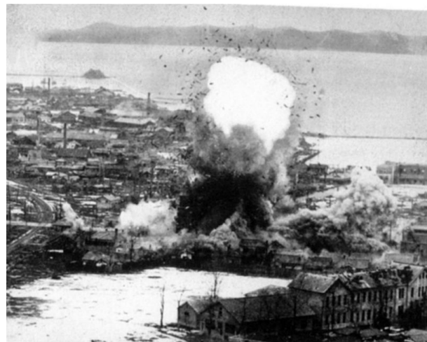
Bombing Wonsan, 1951