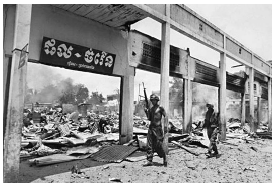
Soldiers patrol ruins of bombed out town in Cambodia

In March 1970, Sihanouk was deposed in a CIA-backed coup led by General Lon Nol. American and South Vietnamese forces invaded the country to bolster Lon Nol’s brutal rule, while the Nixon administration launched covert bombing attacks with the goal of flushing out Khmer Rouge guerillas. 43 White House tapes reveal that President Nixon told Secretary of State Henry Kissinger to “go in there and I mean really go in....I want everything that can fly to go in there and crack the hell out of them.” After the conversation ended, Kissinger called General Alexander Haig to relay the new orders from the president: “He wants a massive bombing campaign in Cambodia....Anything that flies on anything that moves.” 44