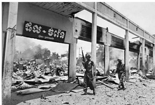
Soldiers patrol ruins of bombed out town in Cambodia

In March 1970, Sihanouk was deposed in a CIA-backed coup led by General Lon Nol. American and South Vietnamese forces invaded the country to bolster Lon Nol’s brutal rule, while the Nixon administration launched covert bombing attacks with the goal of flushing out Khmer Rouge guerillas. 43 White House tapes reveal that President Nixon told Secretary of State Henry Kissinger to “go in there and I mean really go in....I want everything that can fly to go in there and crack the hell out of them.” After the conversation ended, Kissinger called General Alexander Haig to relay the new orders from the president: “He wants a massive bombing campaign in Cambodia....Anything that flies on anything that moves.” 44