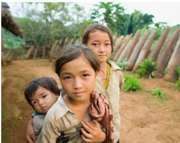
Millions of unexploded bombs remain in Laos