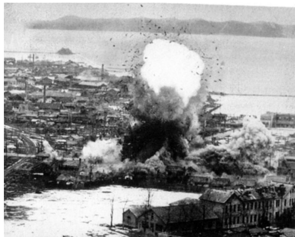
Bombing Wonsan, 1951