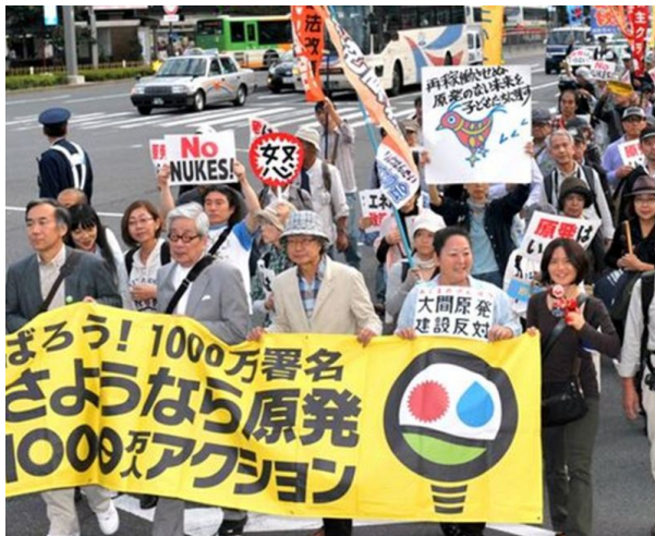
Nobel laureate Oe Kenzaburo (2 nd front left) leads anti-nuclear demonstration in Tokyo on October 13, 2012, the day after TEPCO's admission of guilt

tsunami was an inconceivable black swan event that caused the three meltdowns and hydrogen explosions. Finally, on October 12, 2012 TEPCO abandoned its tsunami defense and acknowledged that the nuclear accident was caused by its excessively optimistic risk assessments, shortchanging of safety and training, and failure to adopt appropriate countermeasures.