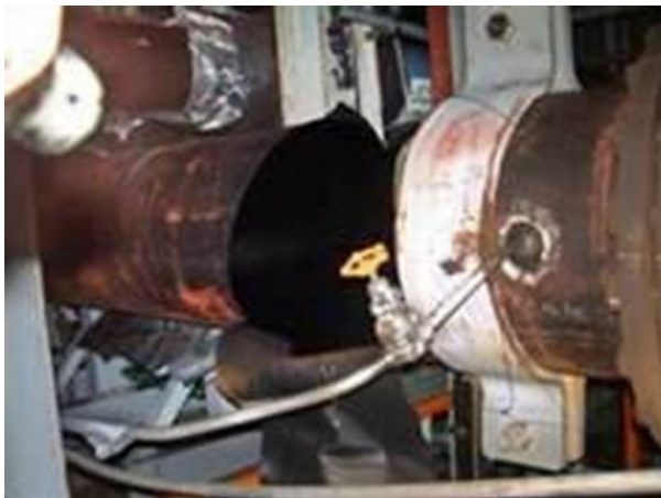
Pipes at aging Mihama reactor ruptured, releasing steam that killed four and injured seven in 2004

phase-out of nuclear power by the late 2030s, but within days quickly disavowed this plan under heavy pressure from business lobby groups. (Asahi 9/19/2012, Asahi 10/4/2012, Japan Times, 10/6/12) It has not officially endorsed a new national energy plan and explained that any decision on energy policy is subject to ongoing review in light of future developments. PM Noda expressed the ambiguity thus: "We need a strategy with both a firm direction and the flexibility to respond to circumstances; while its base line will not waver, it will not restrict future policy excessively." Precisely. The Asahi concludes that the nuclear phase-out is now just a "hollow promise", pointing out that the lack of Cabinet endorsement means that the Innovative Strategy for Energy and Environment is not binding on future governments and will impede implementation. (Asahi 9/19/2012)