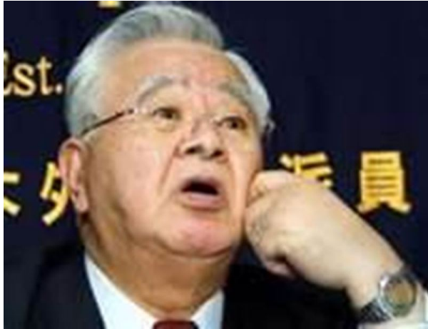
Keidanren Chairman Yonekura Hiromasa

This was a major victory for the nuclear village as a “no decision” opens opportunities to lobby politicians and shape public opinion. Policy drift and biding time play to the advantages and interests of the nuclear village; most of the bad news came out in 2011-2012 and now it is hoping that anger and outrage will diminish. The nuclear village is also hopeful that the LDP will regain power and resume support for nuclear energy as a centerpiece of national energy strategy.