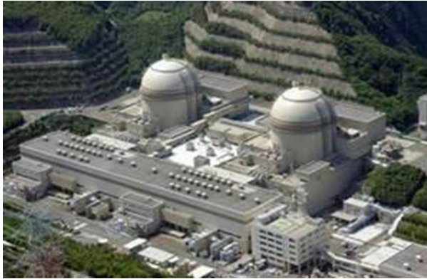
The Oi reactors may be sited on an active fault-line