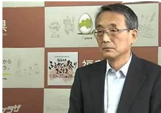
Tanaka Shuichi, head of the NRA

In September 2012, Japan's two discredited nuclear regulatory institutions, the Nuclear and Industrial Safety Agency (NISA) and the Nuclear Safety Commission (NSC) were disbanded and replaced by the Nuclear Regulatory Authority (NRA) with a staff of 480. But the NRA is more a reorganization than a significant reform as 460 of its staff were transferred from NISA and the NSC. NISA was complicit in the utilities systematically downplaying safety and not adopting stricter international safety guidelines and cover-ups of falsified repair and maintenance records. NISA was also ineffective during the 3.11 crisis and failed to provide timely and accurate advice to PM Kan Naoto as the