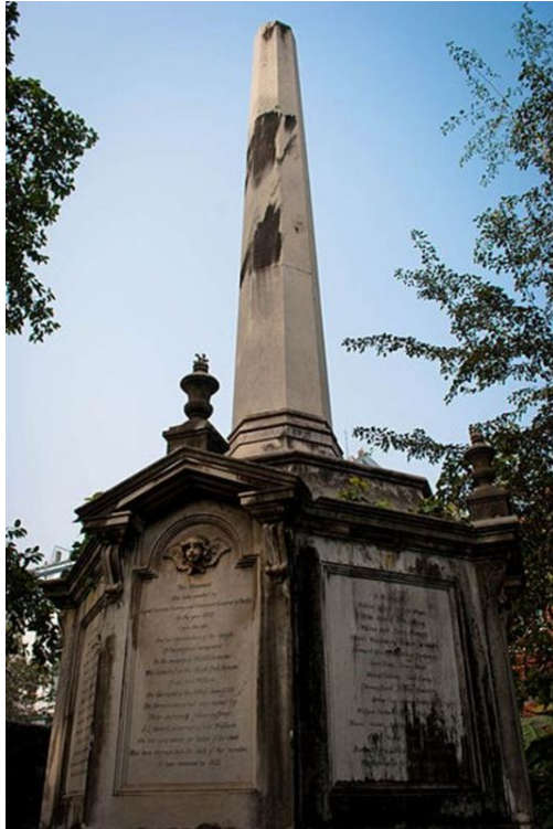
Black Hole Memorial restored by Lord Curzon

Introduction: The Legitimation of Imperial Practices