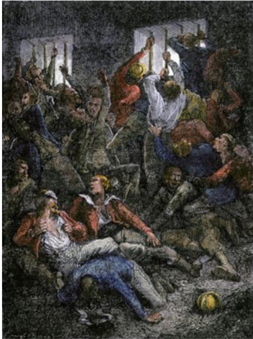
English officers in the Black Hole

Çubukçu: In a memorable formulation, you observe that “modern empire was not an aberrant supplement to the history of modernity but rather its constituent part,” and that “it will continue to thrive as long as the practices of the modern state-form remain unchanged.” Why is this the case? What is it about the modern state-form, which lends itself to empire?