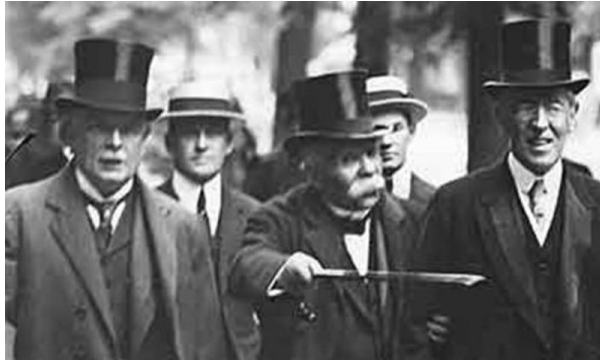
Lloyd George, Georges Clemenceau and Woodrow Wilson arriving at Versailles at the end of World War I

Once again, continuing my analogy with equal citizenship within the nation-state, I will say that the recognition of the principle of formal equality of national sovereignty was a great historical advance achieved by the anti-colonial struggles of the twentieth century. But just as formally equal citizenship in the nation-state does not eliminate real differences in civil society, so does formally equal sovereignty not erase the continued possibility of declaring the colonial exception. We see this every day. Equal sovereignty remains a powerful criterion in evaluating international action, whether diplomatic or military, even though it might not be the only one and even though the specific conditions of its application might be disputed.