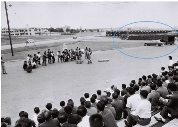
US military PR exercise for Operation Red Hat

These accounts have caused alarm on Okinawa where local residents have, for the past 12 months, been urging the authorities to conduct environmental tests within the bases where U.S. veterans allege Agent Orange had been stored. However, both Tokyo and Washington have refused these requests. 6