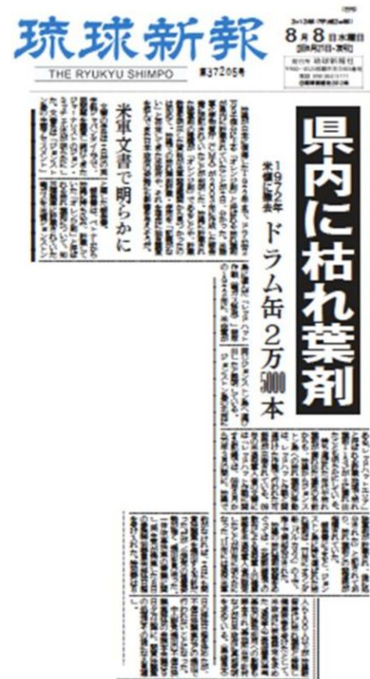
.. and the Ryukyu Shimpo

The army report is the first time the U.S. military has acknowledged the presence of these poisons on Okinawa - and it contradicts repeated denials from the Pentagon that Agent Orange was ever on the island. At the same time that the document was revealed, a series of photographs was also uncovered apparently showing many of the 25,000 barrels in storage on Okinawa's Camp