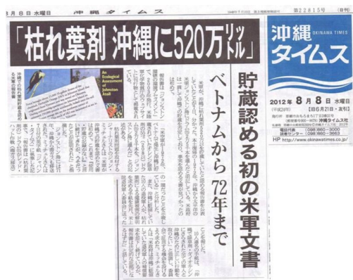
The discovery made the headlines of both the Okinawa Times

During the Vietnam War, 25,000 barrels of Agent Orange were stored on Okinawa, according to a recently uncovered U.S. army report. 1 The barrels, containing over 1.4 million gallons (5.2 million liters) of the toxic defoliant, had been brought to Okinawa from Vietnam before being taken to Johnston Island in the Pacific Ocean where the US military incinerated its stocks of Agent Orange in 1977.