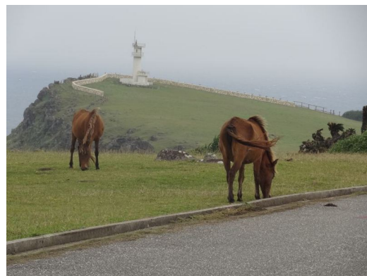
Yonaguni, Site for a Base? (Photograph: Shiba Hiromoto, November 2011)

propitious to any such regional project. However, in 1982 Yonaguni opened a sister city relationship with the Taiwan city of Hualien and in 2007 it became the first city or town in Japan to open its own office in Taiwan (at Hualien). For the 30 th anniversary of the Hualien link, in 2012 a group of 35 Taiwanese on water-ski motor boats surfed onto Yonaguni beaches, vividly demonstrating just how bridgeable was the gap between the two, given only a political will. 13 Although a “Joint Agreement on Border Exchange Promotion” was reached in April 1999 by the mayors of the three Yaeyama islands and their counterpart mayors of three east Taiwan cities of Hualien, Yilan and Daito, with a view to establishing a regular air link and building closer cross border ties in tourism, education and trade, 14 and it referred hopefully to the relationship as one “linking two regions across national borders but maintaining family-like closeness,” exchanges remain at modest levels. Despite the dramatic gesture of the sea-borne motor-bikes in 2012, after thirteen years no regular air or sea link exists.