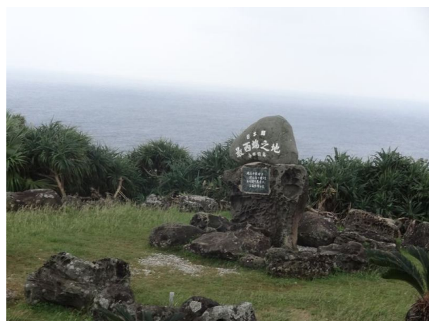
Cape Irizaki, Yonaguni, Westernmost Point in Japan (Photograph: Shiba Hiromoto, November 2011)

It goes without saying that Tokyo holds Yonaguni (and the other Yaeyama islands) to be unquestionable, integral Japanese territory. And yet its status has been much more ambiguous than such a term might suggest.