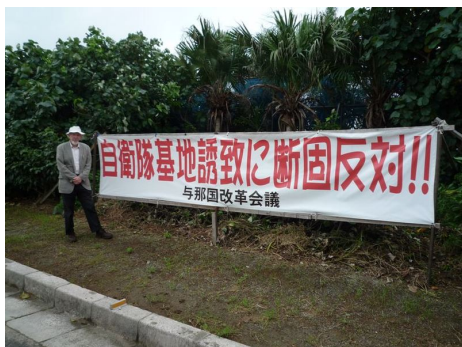
Anti-base poster, Yonaguni, November 2011

East Asia's territorial issues, notably centred now on the Senkaku/Diaoyu Islands, will either be solved, as part of a comprehensive settlement and the construction of a regional order of peace and cooperation in the interests of the surrounding states and peoples, or they will fester and feed heightened confrontation and militarization. It is hard to see evidence of the former at present. As for the latter, it will mean places like Yonaguni becoming more vulnerable and divided.