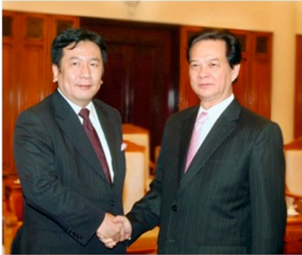
Prime Minister Nguyen Tan Dung (right) and Japanese Minister of Economy, Trade and Industry Edano Yukio in Hanoi.

With this alchemy, Japan's nuclear disaster is turned into an asset to assure the Vietnamese purchaser of Japan's technical expertise.