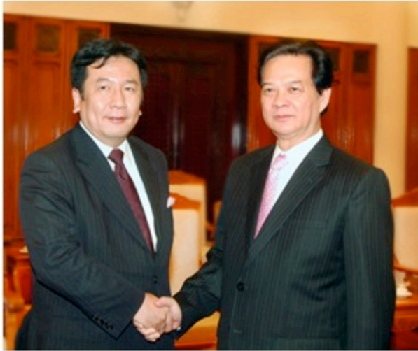
Prime Minister Nguyen Tan Dung (right) and Japanese Minister of Economy, Trade and Industry Edano Yukio in Hanoi.

With this alchemy, Japan's nuclear disaster is turned into an asset to assure the Vietnamese purchaser of Japan's technical expertise.