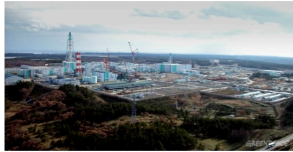
Aerial view of Rokkasho

According to a bureaucrat ( http://mainichi.jp/english/english/perspectives/news/20120626p2a00m0na004000c.html ) interviewed by the Mainichi, the aim of the amendment could be to guarantee the legitimacy of the nuclear waste storage, reprocessing, plutonium extraction and MOX-producing activities of the Rokkasho site located in Northern Japan. This reprocessing chain ( http://archives.lesechos.fr/archives/2012/LesEchos/21190-039-ECH.htm ) jointly built in 1993 with the French company AREVA, has never functioned and its storage capacity of used fuel is now almost saturated: 2834 tons ( http://enformable.com/2012/03/post-fukushima-japan-resumes-work-on-nuclear-fuel-facility-in-aomori-prefecture/ ) of used fuel are now stored in the pools of the plant, fully 90% of its storage capacity.