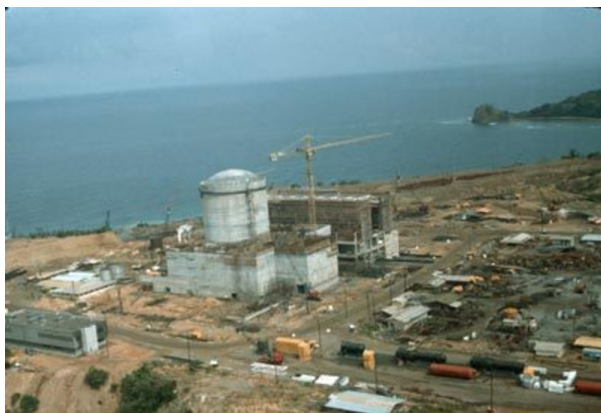
Bataan Nuclear Power Plant