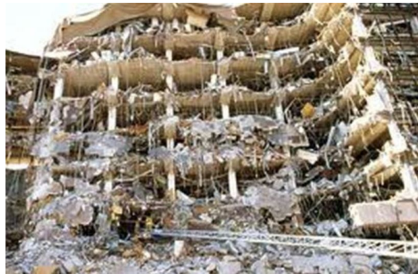
On April 19, 1995, the Alfred P. Murrah Federal Building was bombed, killing 168 and injuring 800.