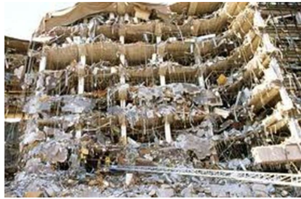
On April 19, 1995, the Alfred P. Murrah Federal Building was bombed, killing 168 and injuring 800.