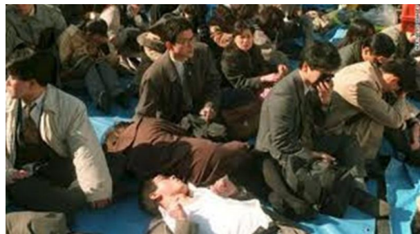
The scene outside a Tokyo subway after the sarin gas attack of March 20, 1995, which killed 13 and injured 6300.

more than 200 some nine months before the subway attack in Tokyo, (c) sarin leaks at the cult's chemical factory in Kamikuishiki, and (d) a front-page Yomiuri headline on New Year's Day 1995 describing chemical compounds detected in Kamikuishiki and linking them to the sarin attack in Nagano? Japanese police were once held in high esteem by many observers, 2 but the colossal failure of police to protect the public against AUM has led some analysts to conclude that while most individual officers may be honest and dedicated, Japan's police force is, as an institution, "arrogant, complacent, and incompetent." 3