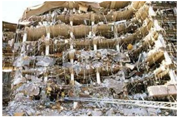
On April 19, 1995, the Alfred P. Murrah Federal Building was bombed, killing 168 and injuring 800.