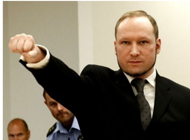
Breivik in Oslo courtroom after sentencing.