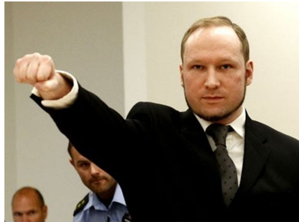
Breivik in Oslo courtroom after sentencing.