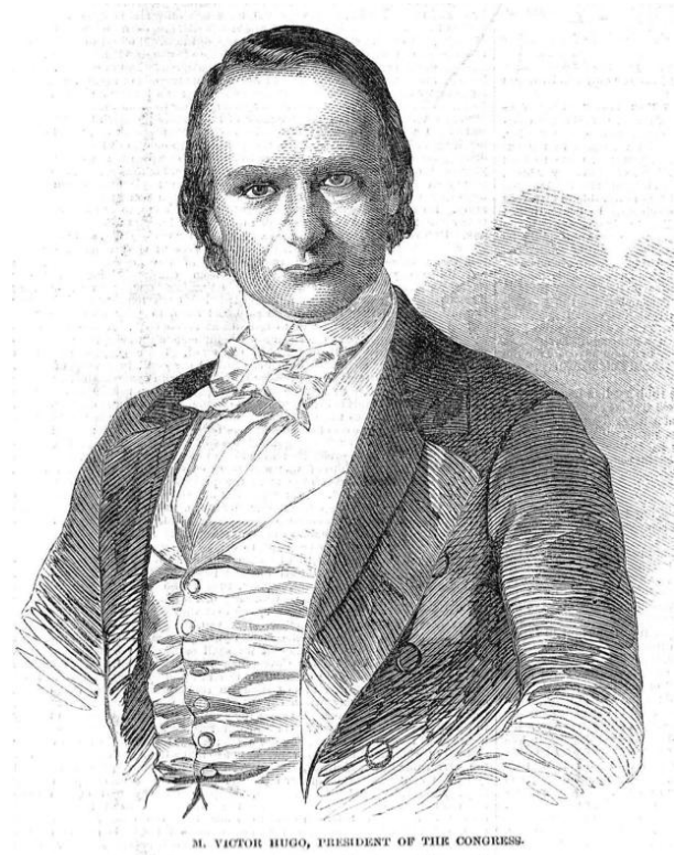
Victor Hugo addresses the Paris Peace Conference, Illustrated London News , 1 September 1849

Tolstoy's thoughts can be traced from his powerful reporting of the Crimean War (which was subjected to Russian censorship), 21 through War and Peace when he was still trying to reconcile the apparent inevitability of war with its essential immorality, to the complete rejection of violence and adoption of total pacifism in his later years. Similarly in the case of Hugo, we can trace a consistent development of his thinking on peace from his address to the first great Peace Conference of 1849 - when he made a prescient appeal for European unity which would make war obsolete - to the impassioned denunciation of war in his speech on the centenary of Voltaire's death (1878) in which he drew a powerful connection between the peace thought of the Enlightenment and the peace campaigns of his own time.