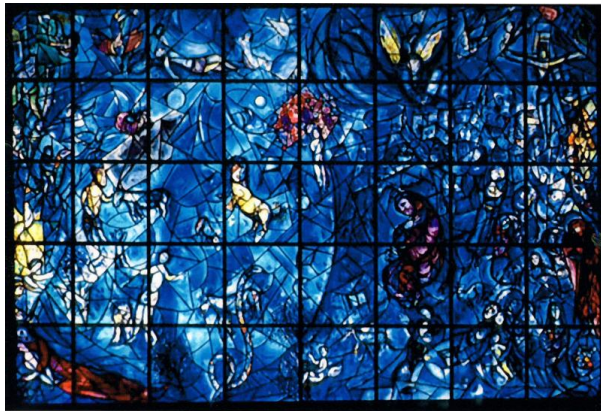
Marc Chagall, 'Peace Window', United Nations Building, New York, 1964

*This essay is an expanded version for Asia-Pacific Journal of an article published by the Oxford Research Group. The Narrative of Peace: What we can Learn from the History of Peace Thought', Oxford Research Group Newsletter ( http://www.oxfordresearchgroup.org.uk/publications/articles_multimedia/narrative_peace_what_we_can_learn_history_peace_thought ), 28 Aug 2012.