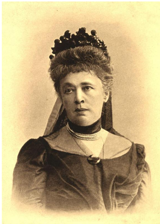
Bertha von Suttner (1843-1914), Austrian peace campaigner and novelist, the first woman to win the Nobel Peace Prize

We must understand that two philosophies, two eras of civilization, are wrestling with one another and that a vigorous new spirit is supplanting the blatant and threatening old. No longer weak and formless, this promising new life is already widely established and determined to survive. Quite apart from the peace movement, which is a symptom rather than a cause of actual change, there is taking place in the world a process of internationalization and unification. Factors contributing to the development of this process are technical inventions, improved communications, economic interdependence, and closer international relations. The instinct of self-preservation in human society, acting almost subconsciously, as do all drives in the human mind, is rebelling against the constantly refined methods of annihilation and against the destruction of humanity.