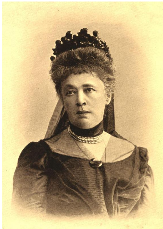
Bertha von Suttner (1843-1914), Austrian peace campaigner and novelist, the first woman to win the Nobel Peace Prize

We must understand that two philosophies, two eras of civilization, are wrestling with one another and that a vigorous new spirit is supplanting the blatant and threatening old. No longer weak and formless, this promising new life is already widely established and determined to survive. Quite apart from the peace movement, which is a symptom rather than a cause of actual change, there is taking place in the world a process of internationalization and unification. Factors contributing to the development of this process are technical inventions, improved communications, economic interdependence, and closer international relations. The instinct of self-preservation in human society, acting almost subconsciously, as do all drives in the human mind, is rebelling against the constantly refined methods of annihilation and against the destruction of humanity.