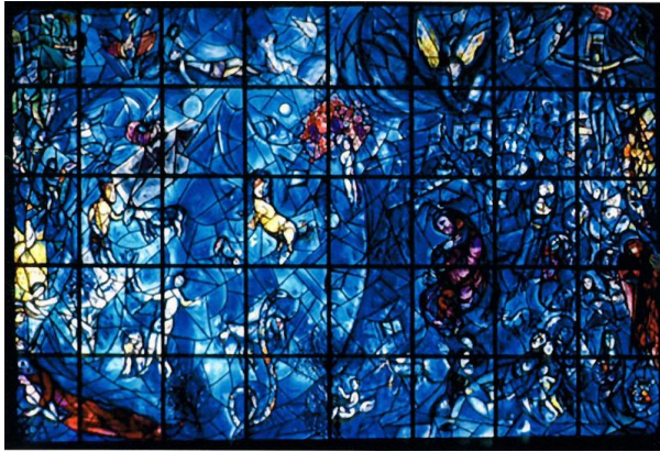
Marc Chagall, 'Peace Window', United Nations Building, New York, 1964

*This essay is an expanded version for Asia-Pacific Journal of an article published by the Oxford Research Group. The Narrative of Peace: What we can Learn from the History of Peace Thought', Oxford Research Group Newsletter ( http://www.oxfordresearchgroup.org.uk/publications/articles_multimedia/narrative_peace_what_we_can_learn_history_peace_thought ), 28 Aug 2012.