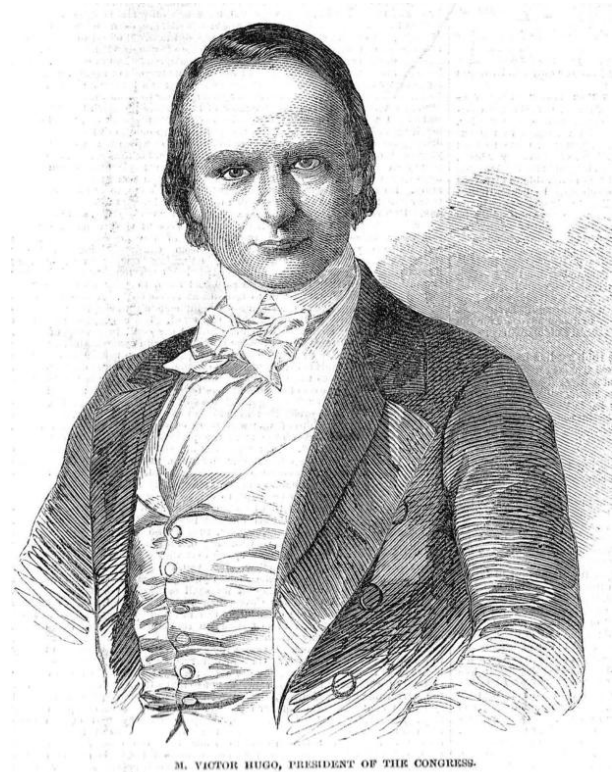
Victor Hugo addresses the Paris Peace Conference, Illustrated London News , 1 September 1849

Tolstoy's thoughts can be traced from his powerful reporting of the Crimean War (which was subjected to Russian censorship), 21 through War and Peace when he was still trying to reconcile the apparent inevitability of war with its essential immorality, to the complete rejection of violence and adoption of total pacifism in his later years. Similarly in the case of Hugo, we can trace a consistent development of his thinking on peace from his address to the first great Peace Conference of 1849 - when he made a prescient appeal for European unity which would make war obsolete - to the impassioned denunciation of war in his speech on the centenary of Voltaire's death (1878) in which he drew a powerful connection between the peace thought of the Enlightenment and the peace campaigns of his own time.