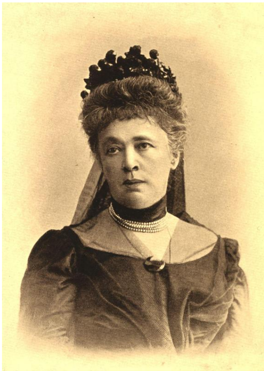
Bertha von Suttner (1843-1914), Austrian peace campaigner and novelist, the first woman to win the Nobel Peace Prize

We must understand that two philosophies, two eras of civilization, are wrestling with one another and that a vigorous new spirit is supplanting the blatant and threatening old. No longer weak and formless, this promising new life is already widely established and determined to survive. Quite apart from the peace movement, which is a symptom rather than a cause of actual change, there is taking place in the world a process of internationalization and unification. Factors contributing to the development of this process are technical inventions, improved communications, economic interdependence, and closer international relations. The instinct of self-preservation in human society, acting almost subconsciously, as do all drives in the human mind, is rebelling against the constantly refined methods of annihilation and against the destruction of humanity.