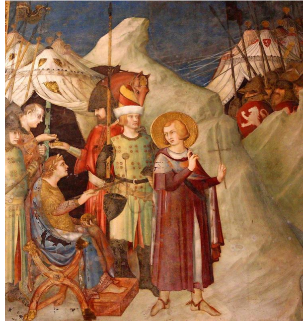
Simone Martini, St Martin Renounces his Weapons' c. 1320, Basilica di San Francesco, Assisi

unquestioning obedience and conscientious objection. The message of the early fathers, such as Origen and Tertullian, was that Christianity (in the phrase of Justin Martyr) had changed the instruments of war, 'the swords into ploughs and the spears into farming implements'. This record of early Christian pacifism has been played down and sometimes ignored altogether in some standard histories of the origins of Christianity. One of the most striking stories from this period is that of Martin (b. AD 316), the young Roman soldier who told his emperor that he would henceforth refuse to fight and become a soldier of Christ instead. Even after the historic compromise between the church and the Emperor, this story shows, there were Christians who continued to believe that military service was incompatible with their faith. The tale of Martin could be described as one of the first recorded cases of conscientious objection. All the more amazing therefore, that in an ironic reversal of roles, St Martin of Tours has become in the Catholic faith the patron saint of soldiers!