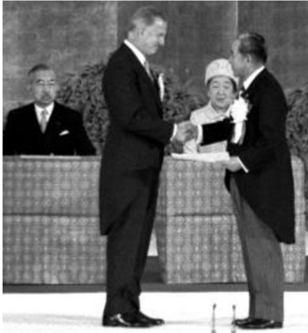
Emperor Hirohito and Empress Nagako in Tokyo look on as US Vice President Spiro Agnew presents Japanese Prime Minister Eisaku Sato with documents returning Okinawa to Japan.

The formal documents and instruments of power were therefore as deceptive and misleading as the Ryukyu expressions of tribute fealty to China and Japan in the seventeenth and eighteenth centuries. Post-1972 Okinawa performed Japanese sovereignty, constitutional pacifism, prefectural self-government, and regional autonomy while in reality sovereignty was only partially returned (the bases and American military sovereignty retained intact). The US-Japan security treaty continued to serve as Okinawa's key charter, in effect transcending and negating the constitution, and all important decisions were reserved to Tokyo and Washington. Despite nominal incorporation in the constitutional pacifist Japanese state,