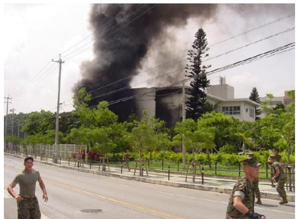
US Marine helicopter crashed into the campus of Okinawa International University, August 13, 2004.