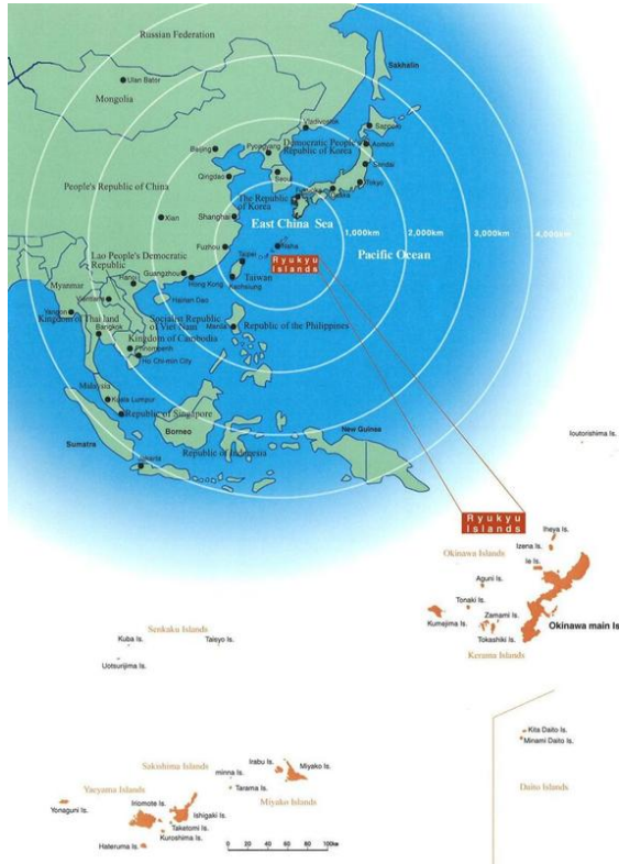
(Map by Executive Office of the Governor, Okinawa Prefecture)

Okinawa's chain of islands—around sixty of them inhabited and many more not—stretch for 1,100 kilometers (683 miles) along the Western Pacific between Japan's Kagoshima prefecture and Taiwan. The largest and most populated island is about one hundred kilometers long and between four and twenty-eight kilometers wide, and the islands as a whole are about one-seventh the area of Hawaii. Linked to the Asian continental landmass until a million or so years ago, the islands have long been separated from it by a gulf sufficiently deep and dangerous to have allowed the emergence in relative isolation of a rich and distinctive human as well as botanical and zoological environment. Today its people are both “Japanese,” speaking more-or-less standard