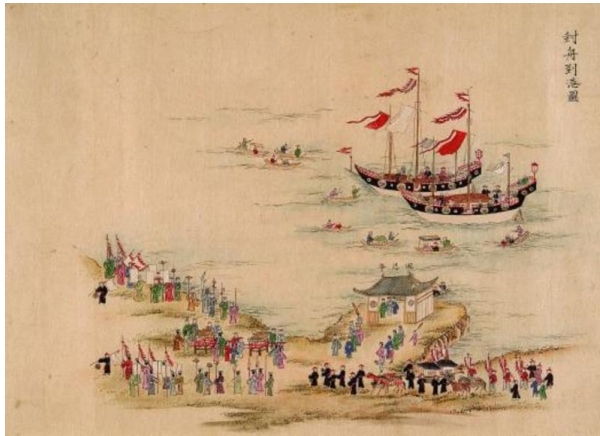
Images of Ryukyu Tributary relationship with China.

the East Asian tribute world centering on Ming China.