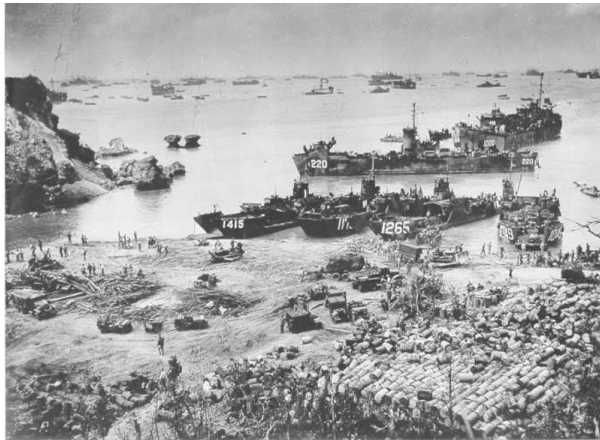
Americans landing in the Battle of Okinawa

this process of identity change, in 1945 Okinawa was to be sacrificed in order to stave off attack on the “mainland” and preserve the “national polity”—meaning the emperor system. Japan's war on Asia came “home” in the cataclysmic Battle of Okinawa, when more than 120,000 Okinawans, between one-quarter and one-third of the population, died. These months, March to June 1945, marked the islands as nothing before or since has. Beneath the surface of contemporary Okinawa, the memory of its horror remains fresh, and it constitutes a well-spring of thinking about the present and future.