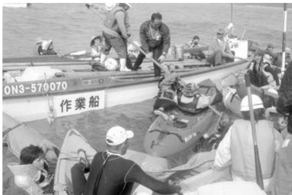
(Struggle between government survey ship and protesters in canoes, November 2004.)

The contest over the Marine Corps base at Futenma and the plan to replace it, commonly represented as a struggle over the question of construction of a single base, is therefore much more. It pits the Okinawan community against the nation-states of both Japan and the United States. We believe that Okinawa as of 2012, fiercely insisting on the constitutional principle of popular sovereignty ( shuken zaimin ), astonishingly holds the advantage. It deserves to be understood in the context of the global democratic movements of the early twenty-first century.