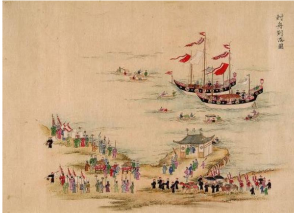
Images of Ryukyu Tributary relationship with China.

the East Asian tribute world centering on Ming China.