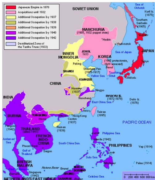
The Japanese Empire, 1870-1942

from the West—in other words, move into Hong Kong and Southeast Asia. There were other reasons that the Japanese army decided to move into French Indo-China, and then to attack the American, British and Dutch colonies—but one important reason was to outflank China, to cut off its connections with the allied powers.