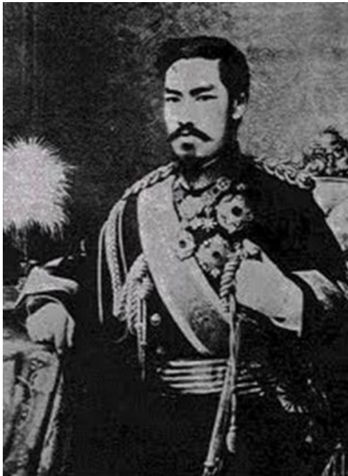
The Meiji Emperor

The ideology focused on the emperor as descended from the founding deities, as national father figure, and as the focus of the citizens' loyalty. He became the symbol of Japanese nationalism.