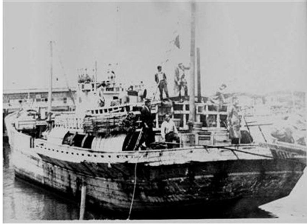
Lucky Dragon #5 returns to port

A petition campaign against the hydrogen bomb began in May 1954 in Tokyo, and quickly led to a nation-wide ban-the-bomb movement. Prior to those events, in December 1953, however, US President Dwight D. Eisenhower gave an “Atoms for Peace” speech at the United Nations, hoping to control nuclear weapons and promote the peaceful uses of nuclear power internationally.