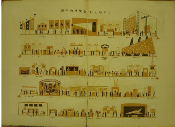
Layout for Atoms for Peace Exhibit, Hiroshima

This article studies editorials and articles of “ 3-dai shi ” (the three major newspapers), the Asahi Shinbun , the Mainichi Shinbun , which did not sponsor an Atoms for Peace exhibit, and the Yomiuri Shinbun , from 1945 to 1955 in order to gauge their positions on the use of nuclear power for peaceful purposes against nuclear weapons, and reconsiders the role of the Yomiuri in Japan’s introduction of nuclear power. The Yomiuri was then Japan’s third largest newspaper, in terms of circulation. There is every reason to examine the first and second largest, the Asahi and the Mainichi , to study the media in Japan’s introduction of nuclear power. 6 It is clear that the Asahi and the Mainichi in their editorials favored the peaceful uses of nuclear power even before Eisenhower’s 1953 “Atoms for Peace” address. All three major newspapers embraced the dual nature of nuclear power, drawing a clear line between peaceful and military uses of nuclear power, even in 1954 when the ban-the-bomb movement surged across Japan following the Lucky Dragon Incident.