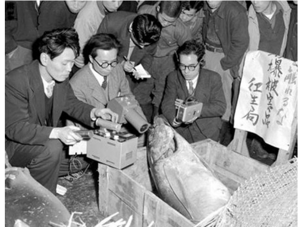
Scientists test tuna for radioactive contamination following the Lucky Dragon No. 5 incident

In the meantime, the tragedy of the Lucky Dragon #5 was reported on March 16th. The Yomiuri was the first to cover the incident in its morning edition on that day. 62 The tuna boat encountered the hydrogen bomb test on March 1st, and took days to return to its mother port in Shizuoka. Informants of Yomiuri reporters, who saw the fishermen, guessed that they suffered from radiation diseases, based on what those informants had read and learned from Yomiuri's earlier series. 63 Other major newspapers followed in their evening editions on the same day. The incident frightened many Japanese about the danger of nuclear bomb tests and the potential for nuclear war, as well as igniting fears that their daily life was in danger from radiation-contaminated food like tuna.