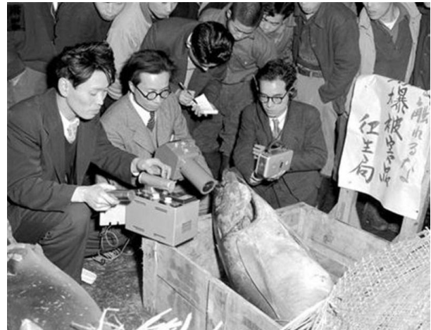
Scientists test tuna for radioactive contamination following the Lucky Dragon No. 5 incident

In the meantime, the tragedy of the Lucky Dragon #5 was reported on March 16th. The Yomiuri was the first to cover the incident in its morning edition on that day. 62 The tuna boat encountered the hydrogen bomb test on March 1st, and took days to return to its mother port in Shizuoka. Informants of Yomiuri reporters, who saw the fishermen, guessed that they suffered from radiation diseases, based on what those informants had read and learned from Yomiuri's earlier series. 63 Other major newspapers followed in their evening editions on the same day. The incident frightened many Japanese about the danger of nuclear bomb tests and the potential for nuclear war, as well as igniting fears that their daily life was in danger from radiation-contaminated food like tuna.