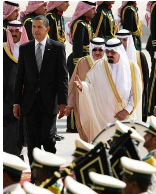
Obama with Saudi King Abdullah, 2010

The wealth of the two nations, America and Saudi Arabia, has become ever more interdependent. This is ironic. In the words of a leaked US cable, “Saudi donors remain the chief financiers of Sunni militant groups like Al Qaeda.” 25 The Rabita or Muslim World League, launched and largely funded by the Saudi royal family, has provided an international meeting place for international Salafists including some al Qaeda leaders. 26