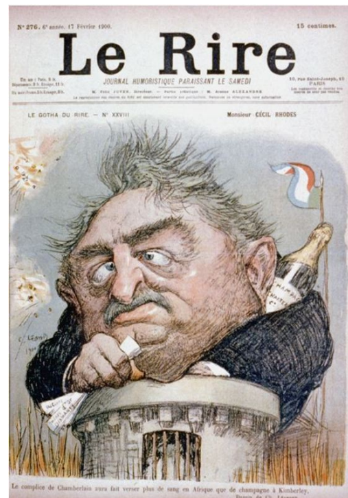
French caricature of Rhodes, showing him trapped in Kimberley during the Boer War, seen emerging from tower clutching papers with champagne bottle behind his collar.

Transvaal attracted the attention of Cecil Rhodes, already wealthy from South African diamonds and mining concessions he had acquired by deceit in Matabeleland. Rhodes now saw an opportunity to acquire goldfields in the Transvaal as well, by overthrowing the Boer government with the support of the uitlanders or foreigners who had flocked to the Transvaal.