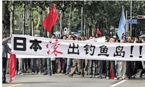
Chinese demonstrators on September 18, 2010 at the Japanese Embassy in Beijing

In this fashion, the Bao-Daio Movement in the Chinese sphere has risen and fallen, to rise again, in response to developments of recent history. One wonders how clearly the ruling Democratic Party of Japan understands this background and prevailing conditions.