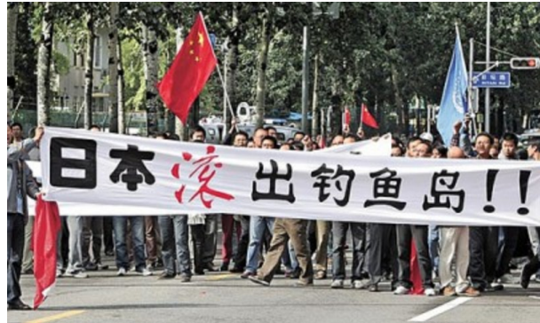
Chinese demonstrators on September 18, 2010 at the Japanese Embassy in Beijing

In this fashion, the Bao-Diao Movement in the Chinese sphere has risen and fallen, to rise again, in response to developments of recent history. One wonders how clearly the ruling Democratic Party of Japan understands this background and prevailing conditions.