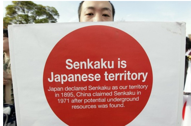
A Japanese demonstrator in a December 2010 Tokyo demonstration