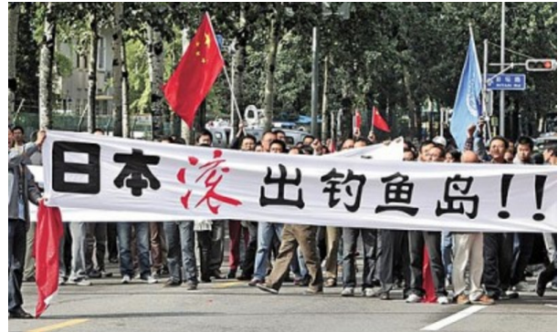
Chinese demonstrators on September 18, 2010 at the Japanese Embassy in Beijing

In this fashion, the Bao-Daio Movement in the Chinese sphere has risen and fallen, to rise again, in response to developments of recent history. One wonders how clearly the ruling Democratic Party of Japan understands this background and prevailing conditions.