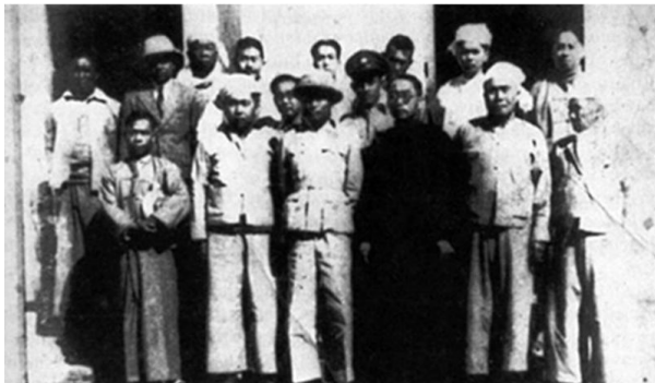
Aung San (center) at the Panglong Conference

resistance forces. Last year, to address these underlying problems, Suu Kyi called for the convention of a second “Panglong Conference,” in reference to an agreement that her father Aung San, who led Burma’s struggle for independence from Britain, signed with representatives of the Shan, Kachin and Chin peoples at the small market town of Panglong on February 12, 1947. The agreement paved the way for a new federal constitution, which was adopted in September of that year, and independence for Burma which was declared on January 4, 1948.