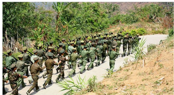
Kachin Independence Army in a 2009 photo

a ceasefire agreement between the government and one of Burma's most powerful ethnic rebel groups, the Kachin Independence Army (KIA), broke down. The KIA had made peace with the central government in 1994 ending decades of civil war. But the agreement never produced a political solution to the group's calls for autonomy and other rights.