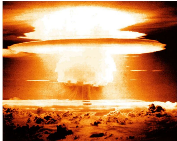
Bravo test at Bikini Atoll (March 1, 1954)

sickness, with such effects as loss of hair and low white blood cell counts, hemorrhages, and skin lesions. 12 The New York Times carried its first article about the exposure of the 264 on March 12, 1954. 13