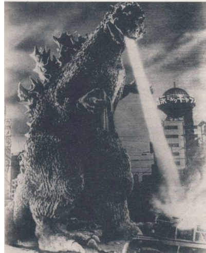
Gojira! King of the Monsters (1954)

Godzilla emits radioactive-fire breath, and as he stomps through Tokyo, he blazes a radioactive trail, burning Japanese boats and torching cities just as bombs do. The scenes that depict Tokyo after the destruction refer both to the nuclear devastation of Hiroshima and Nagasaki and the 1945 firebombing of Tokyo and every other Japanese city with a population in excess of 50,000 people. The sudden presence of this monster is legitimized by its birth in an atomic explosion; no further explanation is necessary.