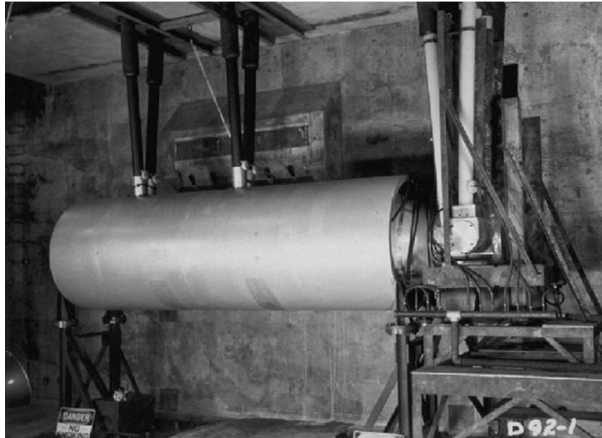
The Bravo nuclear device before detonation

explosive force of 15 megatons of TNT, a force one thousand times more powerful than existing fission weapons and at least twice as powerful as the weapon's designers had predicted. 8