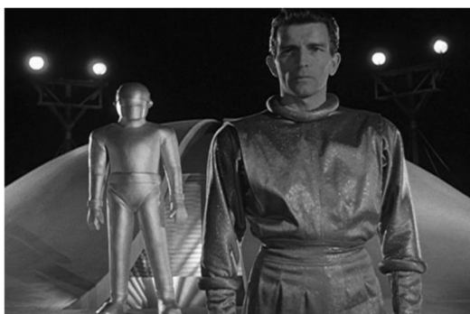
Klaatu and Gort in The Day the Earth Stood Still (1951)

While scientists and politicians would have put themselves in danger had they openly articulated such a critique, Americans accepted the idea when they found it expressed in the popular 1951 science-fiction film, The Day the Earth Stood Still . 42 Often described as a Christian allegory, in which the peaceful and Christ-like Klaatu (who takes the Earth name Mr. Carpenter) descends from the heavens to deliver the new law of nonviolence to the barely mature earthlings, The Day the Earth Stood Still contained radical messages folded into the very structure of the film’s narrative. 43