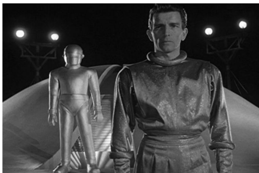
Klaatu and Gort in The Day the Earth Stood Still (1951)

While scientists and politicians would have put themselves in danger had they openly articulated such a critique, Americans accepted the idea when they found it expressed in the popular 1951 science-fiction film, The Day the Earth Stood Still . 42 Often described as a Christian allegory, in which the peaceful and Christ-like Klaatu (who takes the Earth name Mr. Carpenter) descends from the heavens to deliver the new law of nonviolence to the barely mature earthlings, The Day the Earth Stood Still contained radical messages folded into the very structure of the film’s narrative. 43