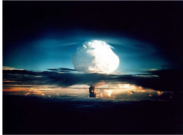
The mushroom cloud from the Mike shot

Fallout was not discussed in detail in the early rush of articles and books about nuclear weapons after 1945: it forced its way into public consciousness through a series of events that devastated the health of those involved. On November 1, 1952, the first United States test of a thermonuclear weapon, or H-bomb (the "Mike" shot of Operation Ivy, exploding approximately 10 megatons) was carried out on Elugelab Island, in the Pacific Ocean.