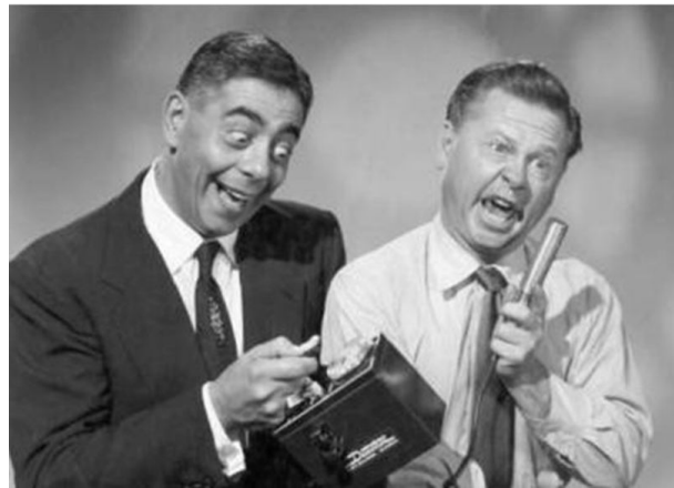
Mickey Rooney and Robert Strauss play with a Geiger counter in The Atomic Kid (1954)

awry. Not unlike the maxim about a gun seen on stage during a play—that it must go off by the third act—the clicking of a Geiger counter in a 1950s science-fiction film signified that something was about to go terribly wrong and that objects and events that might otherwise seem physically impossible (like invisible creatures that suck the brains out of unsuspecting humans) are about to happen.