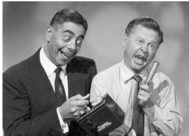
Mickey Rooney and Robert Strauss play with a Geiger counter in The Atomic Kid (1954)

awry. Not unlike the maxim about a gun seen on stage during a play—that it must go off by the third act—the clicking of a Geiger counter in a 1950s science-fiction film signified that something was about to go terribly wrong and that objects and events that might otherwise seem physically impossible (like invisible creatures that suck the brains out of unsuspecting humans) are about to happen.