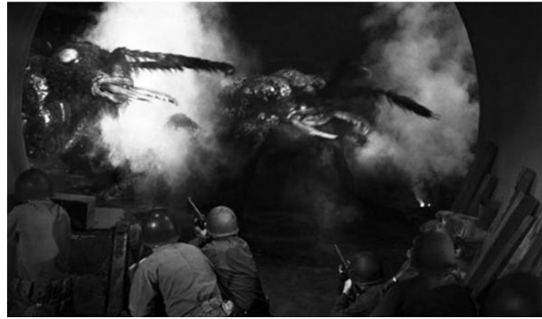
The Army torches some giant ants in Them!

Between 1945 and 1965, over five hundred science-fiction films, many depicting such threats as the giant ants in Them! were released to the theatergoing public. 27 On film, the atomic age was filled with regenerate monsters and invading aliens. In these movies, radiation functioned as a catalyzing element, legitimizing the birth into our world of evil and destructive forces. Whether these threats materialized as monsters generated or regenerated from beneath the ocean, the desert, or the polar icecaps, or as invading aliens who sought to destroy the Earth, radiation functioned as their life-giving source: the threat either was born out of radiation or was feeding off it. Atomic test sites, nuclear power plants, and atomic labs were common science-fiction movie settings.