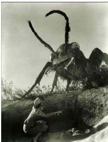
A giant ant from Them! (1954)

"If those monsters got started as a result of the first atomic bomb test in 1945, what about all of the others that have been exploded since then?" 25 This question, expressing Americans' anxiety about atomic testing during the mid-1950s, was to be answered in abundance by Hollywood filmmakers. 26