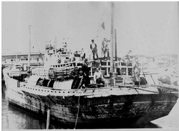
The Lucky Dragon #5 in 1954

incident in the spring of 1954 the New York Times still put the word “fall-out” in quotation marks. Prior to the Bravo test, fallout, when mentioned in the press, was generally referred to as “residual” or “lingering” radiation.