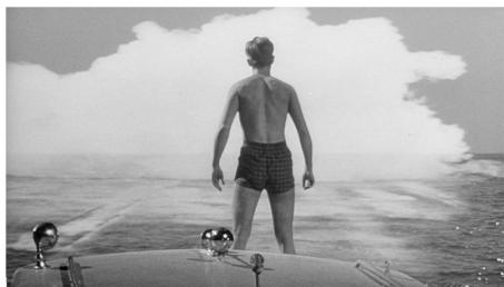
Scott Thomas faces the fallout cloud from a Pacific Test that would shrink him in The Incredible Shrinking Man (1957)

On what appeared to be a normal day off the Pacific coast of California, Scott Thomas was relaxing on his boat and enjoying a peaceful day of leisure. His wife had just gone below to grab two beers when he noticed a strange fog approaching. He stood up, and for a moment, the fog enveloped him. The cloud passed, and when his wife returned, she saw that Scott seemed to be covered with glitter. The couple thought nothing of this until the impossible began to happen: Thomas began to shrink; he had been transformed into The Incredible Shrinking Man . 1