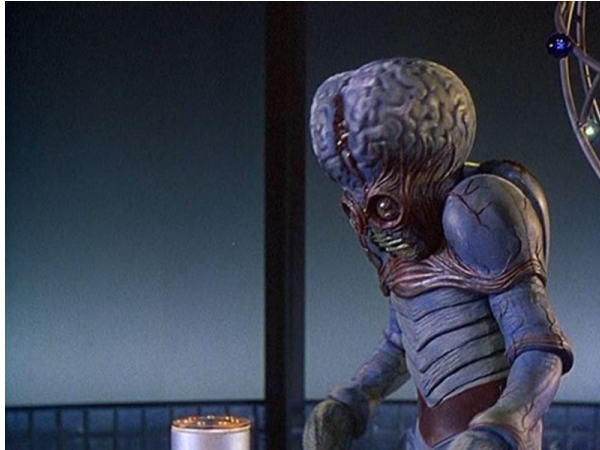
An alien from This Island Earth (1955)

In This Island Earth (1955), nuclear scientists are again the targets of invading aliens as the invaders are in need of experts to help them refuel their dying planet. Targeted scientists are first contacted by being sent the schematics to a sophisticated device that can communicate and transport matter. Once the Earth scientists have constructed the device, the aliens begin to communicate with them and enlist their help. In this instance, the natural technological curiosity of the nuclear scientists provides an entry point to admit alien forces into this world. 39