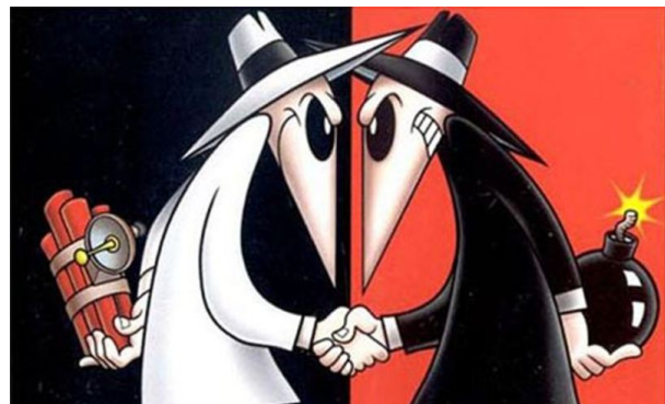
Antonio Prohias's black and white spies in “ Spy Vs. Spy ” in Mad Magazine (1960s)

While both these films used Christianity as a vehicle for critiquing the Cold War, it is striking that both used science fiction to articulate that opinion. Science fiction, with its inherent suspension of the rules of the real world, allowed the audiences of these films to gain a perspective on the world of the Cold War, one not readily found in mass culture. It allowed Americans to step back and see their moment in history from a “big-picture” vantage point, recognizing problems in which they had previously been too caught up to see clearly.