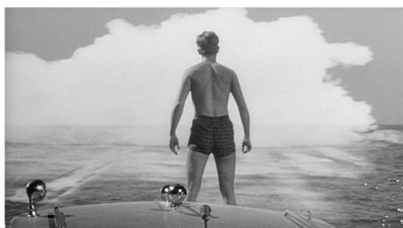
Scott Thomas faces the fallout cloud from a Pacific Test that would shrink him in The Incredible Shrinking Man (1957)

On what appeared to be a normal day off the Pacific coast of California, Scott Thomas was relaxing on his boat and enjoying a peaceful day of leisure. His wife had just gone below to grab two beers when he noticed a strange fog approaching. He stood up, and for a moment, the fog enveloped him. The cloud passed, and when his wife returned, she saw that Scott seemed to be covered with glitter. The couple thought nothing of this until the impossible began to happen: Thomas began to shrink; he had been transformed into The Incredible Shrinking Man . 1