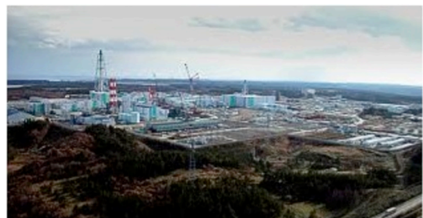
Aerial view of Rokkasho plant in Aomori