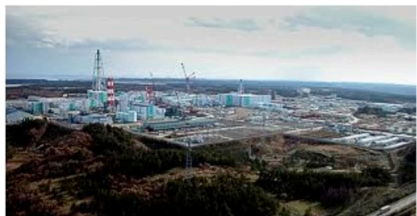
Aerial view of Rokkasho plant in Aomori