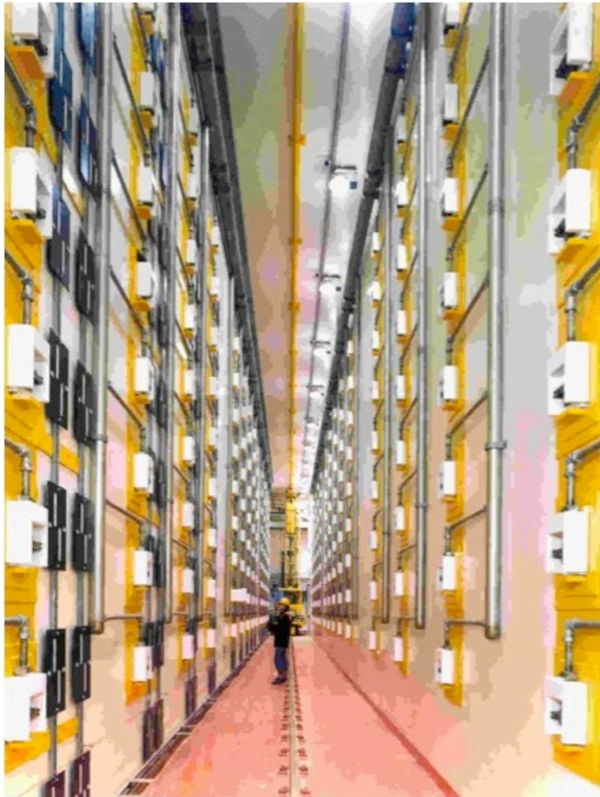
Plutonium storage area, Sellafield, England

warheads. Most of this plutonium is stored in France and Britain. 5