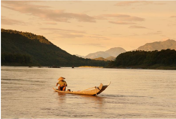
Fishing on the Mekong River, Luang Prabang, Lao PDR

The ‘modern’ sector is the industry-based, emerging modern economy. Occupation in the modern sector is generally wage employment, in contrast to the subsistence-based activities of the traditional sector. While it is generally more urbanised, the modern sector does still involve rural activities such as commercial fishing and cash crop agriculture. The most basic distinction between the modern and traditional sectors is that the former ‘is driven by money’, while the latter ‘uses very little or no money’ (MRC/WUP-FIN, 2007: 95).