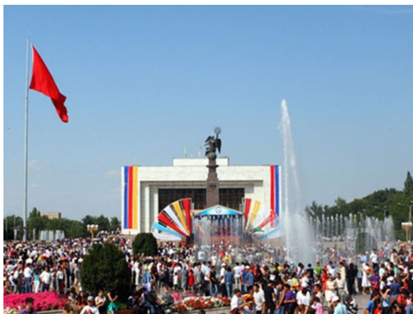
Bishkek Square during the “tulip revolution”