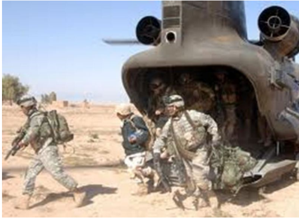
U.S. invasion of Iraq

Shortly before the 2011 NATO intervention in Libya, Qaddafi, according to a Russian article, initiated a movement, like Saddam Hussein's, to refuse the dollar for oil payments. 11 Meanwhile Iran, in February 2009, announced that it had "completely stopped conducting oil transactions in U.S. dollars." 12 The full consequences of Iran's daring move have yet to be seen. 13