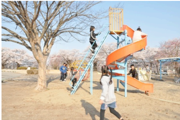
Children at play at Yonomori Park, April 21, 2012 at the peak of cherry blossom viewing

Growing concern about the health risks for children aside, residents of the city appear to be leading ordinary lives. At Yonomori Park, the most popular site for “Hanami” viewing in the city, about a dozen children played in the sand under the beautiful cherry blossom on April 21st – admittedly a much smaller number than usual.