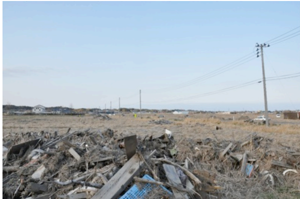
Odaka under mountains of debris one year after the earthquake

The area is like a wasteland. There is almost no life, most facilities are closed, the shopping street is dead and everything has basically frozen in time since March 11, 2011.