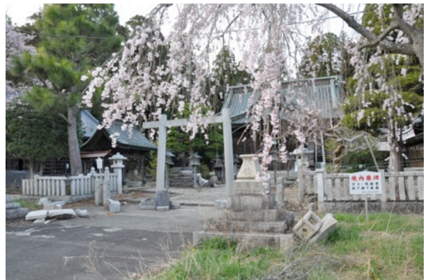
Odaka-Shrine--deformed by the earthquake

April is a symbolic month in Japan because thousands of students enter new schools. Some public schools in the city that were closed amidst fears of high radiation are now able to reopen, based on the results of the local governmental reports on decontamination.