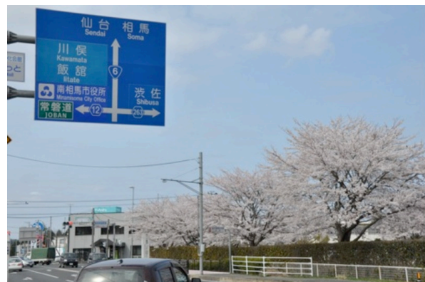
Cherry blossoms in Minami-soma

Even if it were safe, Odaka has other problems: “There is no reconstruction of public facilities and infrastructure, and I wonder how we can make a living there.” There is also growing anxiety over the compensation process among evacuees inside the newly liberated zone. Does this mean that compensation is going to be halted, as many fear?