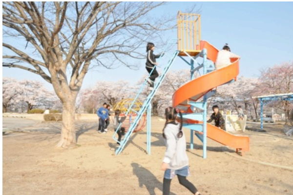
Children at play at Yonomori Park, April 21, 2012 at the peak of cherry blossom viewing

Growing concern about the health risks for children aside, residents of the city appear to be leading ordinary lives. At Yonomori Park, the most popular site for “Hanami” viewing in the city, about a dozen children played in the sand under the beautiful cherry blossom on April 21th – admittedly a much smaller number than usual.