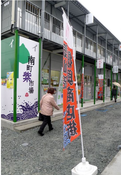
Fig. 2: The prefab Mina-machi Murasaki Ichiba (Violet Market) in Kesenuma, Miyagi Prefecture. Photograph by author, 11 March 2012.

The 3/11 daishinsai sparked a lively debate in the Asahi Shinbun and elsewhere about whether the crisis would occasion the spread in Japan of kifubunko or “a culture of giving.” 8 On its website JACO (Japan Association of Charitable Organizations) lauded the temporary (five-year) post-3/11 tax reforms that allows individuals to either deduct from their income tax or to gain as a tax credit, 80% of their donations, up from the earlier limit of 10%; for incorporated donors, the entire amount of a donation (to registered outfits) is tax deductible. A recent permanent reform, building on progressive legislation passed in 1998 concerning the role of incorporated NGO/NPOs, allows individuals to either deduct