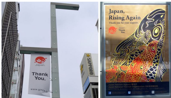
Fig. 3: "Thank you" banners and posters in Tokyo, Ginza and Roppongi Hills, respectively.

reconstitution of neighborhood and commercial associations that had been a casualty of the hellish tsunami and fire. Decisive local, regional and central leadership is crucial, he acknowledged, but not to the extent of extinguishing citizens' critical agency, especially if a community is regain its coherence and capacity for sustainability. 31