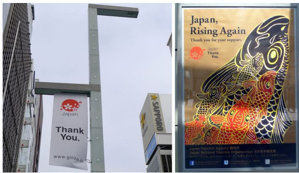
Fig. 3: "Thank you" banners and posters in Tokyo, Ginza and Roppongi Hills, respectively.

reconstitution of neighborhood and commercial associations that had been a casualty of the hellish tsunami and fire. Decisive local, regional and central leadership is crucial, he acknowledged, but not to the extent of extinguishing citizens' critical agency, especially if a community is regain its coherence and capacity for sustainability. 31