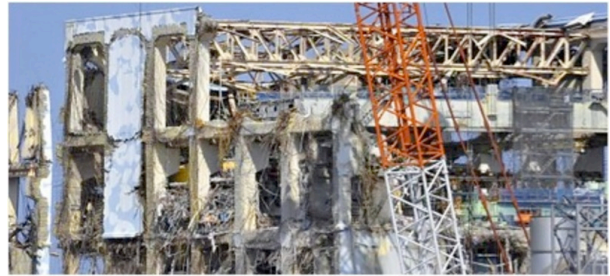
Reactor # 4 at Fukushima Daiichi

Cesium-137 at the Fukushima Daiichi site is 85 times greater than at Chernobyl.