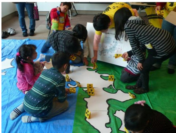
Children during Conference for a Nuclear Free World, Yokohama, Jan.14-15, 2011.