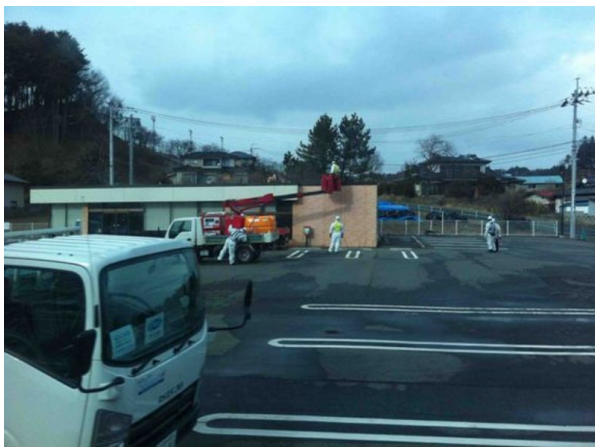
Decontamination work ( josen ) in Iidatemura, 13 January, 2012.

The major problem is that the government is not investing enough in monitoring devices for food. Of course, these devices are more expensive than simple dosimeters, and there is also the high cost of the labor required to perform systematic tests. However, this would be more effective than the "decontamination" operations being proposed and conducted in Fukushima. For example, the nuclear lobby has urged the Government to provide grants for cleaning with pressurized water guns!