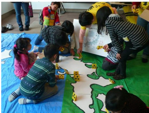
Children during Conference for a Nuclear Free World, Yokohama, Jan.14-15, 2011.