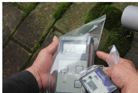
A hot spot in the suburbs of Fukushima city, August 2011: the dosimeter records 6.25 microsieverts per hour (54.75 mSv a year).

In fact, the debate has been greatly distorted since World War II, starting with the American "Atoms for Peace" program of 1953 that promoted nuclear power globally and in Japan sought to sweeten the pill of the atomic bombings of Hiroshima and Nagasaki by clearly distinguishing the ravages of nuclear weapons from the benefits of nuclear power. 1 The result is that, for sixty years, nuclear industry-subsidized pseudo-scientific research has greatly simplified the health consequences of exposure to ionizing radiation. 2