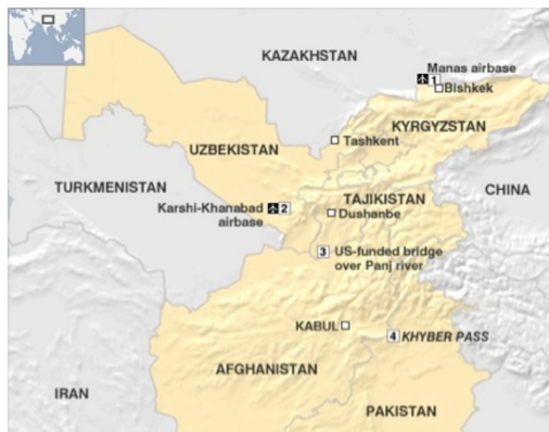
Map showing US bases including Karshi-Khanabad