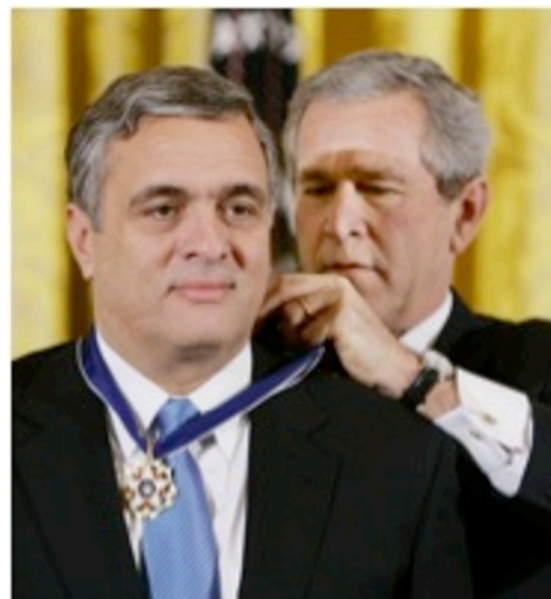
President Bush awarding National Medal of Honor to George Tenet, Dec. 14, 2000