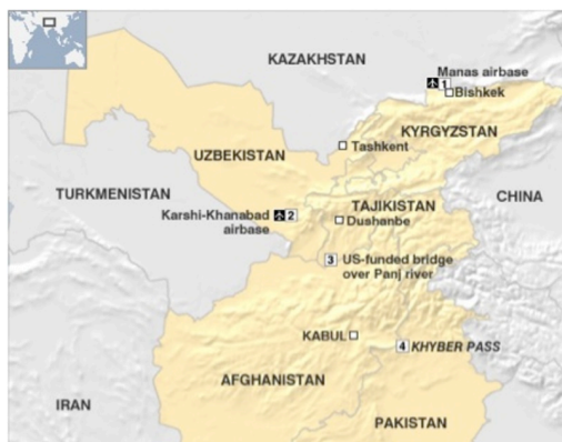
Map showing US bases including Karshi-Khanabad