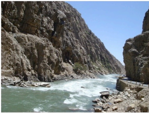
Panjshir valley, area of Northern Alliance dominance