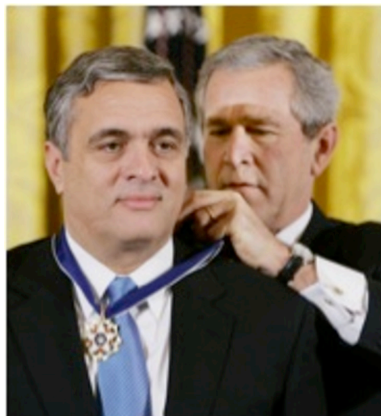
President Bush awarding National Medal of Honor to George Tenet, Dec. 14, 2000

there has been what former 9/11 Commission staffer John Farmer has called either “unprecedented administrative incompetence or organized mendacity” on the part of key figures in Washington. 30 These figures include President Bush, Vice-President Cheney, NORAD General Richard Myers, and CIA Director George Tenet. They include also President Clinton’s National Security Advisor, Samuel Berger, who prior to testifying on these matters, went to the National Archives and removed, and presumably destroyed, key relevant documentation. 31 In his book, Farmer has in effect endorsed both of these alternatives.