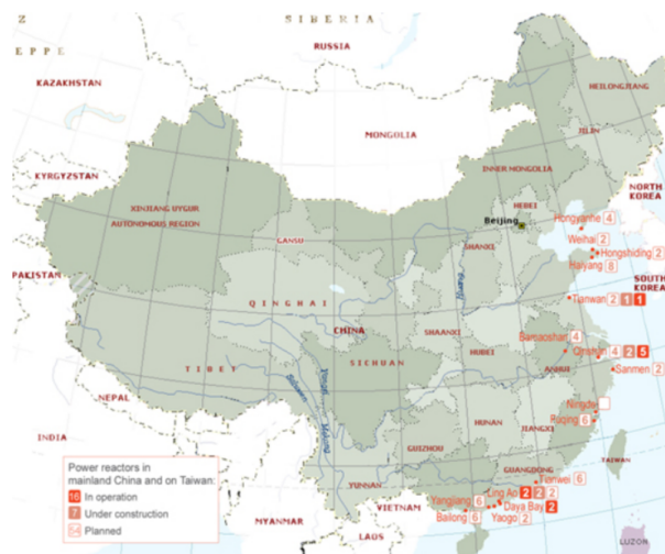
Mainland China in 2010 had 16 nuclear power reactors in operation, 7 under construction, and 34 planned. China's existing and planned nuclear power sites (IAEA map based on July 2010 data.)

Prior to Fukushima, China had been pursuing the world's most ambitious nuclear power program. Following Fukushima, this is still the case. Its nuclear expansion goals are primarily