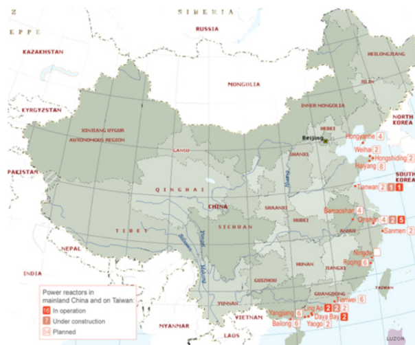
Mainland China in 2010 had 16 nuclear power reactors in operation, 7 under construction, and 34 planned. China's existing and planned nuclear power sites (IAEA map based on July 2010 data.)

attainable for many developing countries. Nuclear power was not initially a credible energy policy option for these countries as they did not possess the necessary capital and capacity to develop the complex infrastructural, technical and financial arrangements necessary for the successful operation of a civilian nuclear energy programme. However, many of these countries have experienced economic take-offs in the decades since the two major pre-Fukushima nuclear disasters, namely, Three Mile Island and Chernobyl. They have consequently been faced with a commensurate growth in energy demand and this has served to enhance the appeal of nuclear power.