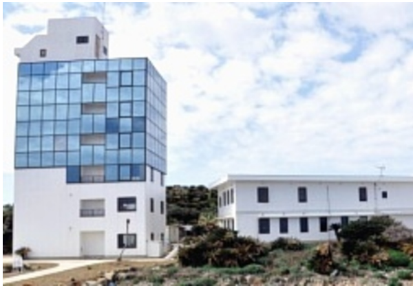
"Beyond the Law" Tasuton Airport Buildings, Mage Island February 2010

and several buildings presumed to be staff quarters, 12 keen also to investigate apparent breaches of various laws including the Forest Law and to survey the deer population because of suspicion of its drastic decline.