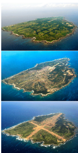
Photographs by Asahi shimbun showing apparent breach of forest law by unlicensed development From top down, the island in June 2004, November 2006, and July 2011

In the early 21st century, it seemed that the speculative investment might be about to pay off. After the scrapping of successive blueprints based on agriculture and fisheries, tourism, heavy industry, and the nuclear and space industries, the military path seemed to offer the best prospect. The Department of Defense was identified as the best potential customer to buy (or lease) the land. With that prospect in mind, Taston Airport (which in 1995 took over from Mage Island Development Company) began clearing the pristine landscape and during the first decade of the 21st century constructed two runways, 4,200 metres south-north and 2,400 metres east-west. The 441 hectare forest that existed in 2002 shrank by approximately four tenths, and an airport of a scale comparable to Tokyo’s Narita or Osaka’s Kansai emerged on the uninhabited island. 4