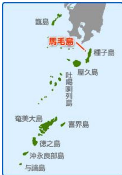
Mage Island (in red), In the Satsunan Islands just south of Kagoshima

including the ruddy kingfisher and the skylark, and known in particular for its own sub-species of deer, the “Mage deer.” Mage was only sporadically populated by groups of fishermen till modern times. The researcher who probably knows the island best, having visited it with his students each year between 1987 and 2000, after which access was closed, describes it as a “Treasure island” of life. 1