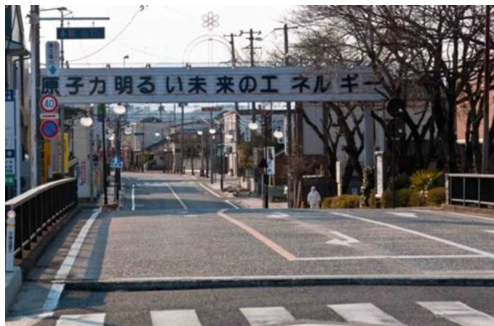
Signboard of Futaba Town saying "Nuclear Power: Energy for Bright Future" ( genshiryoku akarui mirai no enerugi ) on 29 March 2011.

This article examines the problems associated with the fact that Japanese nuclear power plants have multiple reactors within one plant and are concentrated in specific regions. It analyzes the situation from international, domestic, and local perspectives, revealing features of Japanese state-local relations.