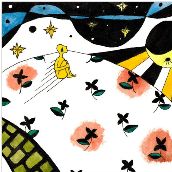
Giovanni found himself on top of a hill

Following the immense tragedy of 11 March 2011 in the Tohoku region, the works of Miyazawa Kenji, who was born, raised and spent most of his life in Tohoku's Iwate Prefecture, have received a new burst of interest among all age groups in Japan. His poem "Strong in the Rain," arguably the best-known and most often memorized poem of modern Japan, has been taken up as a kind of prayer or incantation, to give strength to people faced with unbearable adversity and grief. Actor Watanabe Ken's reading of it on Youtube ( http://www.youtube.com/watch?v=hvFEffacY5g ) has had nearly a million hits; and the poem has been quoted widely in the media as containing the sentiment most needed by Japanese people today.