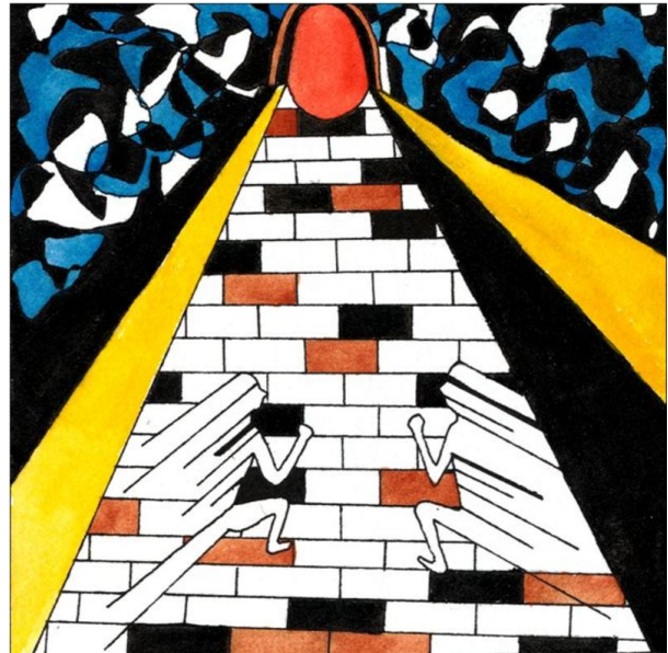
The two boys ran as fast as their two legs would take them

He runs down to the river only to discover that a boy has drowned. The boy, Campanella, tried to save another boy who had fallen in the river. The other boy, who was actually a bully, was saved. But Campanella disappeared into the depths of the river.