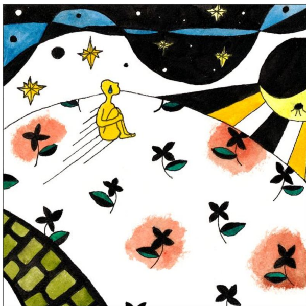
Giovanni found himself on top of a hill

Following the immense tragedy of 11 March 2011 in the Tohoku region, the works of Miyazawa Kenji, who was born, raised and spent most of his life in Tohoku's Iwate Prefecture, have received a new burst of interest among all age groups in Japan. His poem "Strong in the Rain," arguably the best-known and most often memorized poem of modern Japan, has been taken up as a kind of prayer or incantation, to give strength to people faced with unbearable adversity and grief. Actor Watanabe Ken's reading of it on Youtube ( http://www.youtube.com/watch?v=hvFEffacY5g ) has had nearly a million hits; and the poem has been quoted widely in the media as containing the sentiment most needed by Japanese people today.