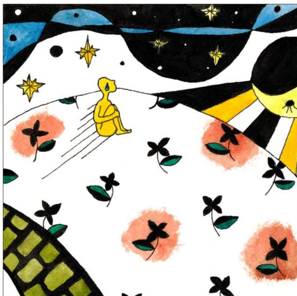
Giovanni found himself on top of a hill

Following the immense tragedy of 11 March 2011 in the Tohoku region, the works of Miyazawa Kenji, who was born, raised and spent most of his life in Tohoku's Iwate Prefecture, have received a new burst of interest among all age groups in Japan. His poem "Strong in the Rain," arguably the best-known and most often memorized poem of modern Japan, has been taken up as a kind of prayer or incantation, to give strength to people faced with unbearable adversity and grief. Actor Watanabe Ken's reading of it on Youtube ( http://www.youtube.com/watch?v=hvFEffacY5g ) has had nearly a million hits; and the poem has been quoted widely in the media as containing the sentiment most needed by Japanese people today.