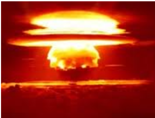
The Bikini blast

On my way home, beside Komaba's main gate, I listened to a speaker, his back to a sign that attacked the H-bomb test at Bikini, and was shocked to learn that because of his father's death, one young crewman had had to drop out of junior high school: his situation was not far different from my own. 1