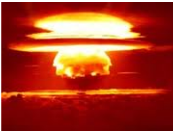
The Bikini blast

On my way home, beside Komaba's main gate, I listened to a speaker, his back to a sign that attacked the H-bomb test at Bikini, and was shocked to learn that because of his father's death, one young crewman had had to drop out of junior high school: his situation was not far different from my own. 1