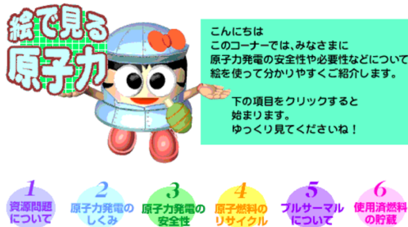
Genshi-Chan The Ultimate Lil' Atom

The spot was appropriately subdued, after all, TEPCO has long courted some of the best-paid copy artists, advertising executives and even manga artists in the business, such as Hirokane Kenji, famous for his long-running salaryman series "Shima Kosaku," also produced "Genshi-chan" or Lil' Atom as a TEPCO mascot.