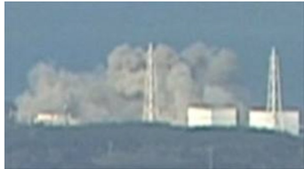
Fukushima reactors explode

fighting the reactor fires as radiation drifts over the Kanto region of 45 million people, including metropolitan Tokyo's 13 million residents. How bad this gets is anyone's guess.