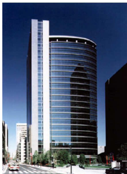
Tepco's Shinsaiwashi Building

Let us take a closer look at TEPCO, the core of the complex of vested interests.