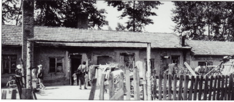
The former kempei headquarters (right).