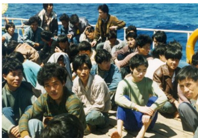
Fujian undocumented migrants on the deck of a fishing boat.

Accompanying payment for the visa, there were also extra costs was associated with pooling money. Only a few families already had members working abroad and therefore could afford the initial costs. Most immigrant families borrowed at high interest (usually 1 percent every month) or obtained loans through rotating credit associations. Many Fujian students had to quit school and become visa-overstayers because of the financial burden.