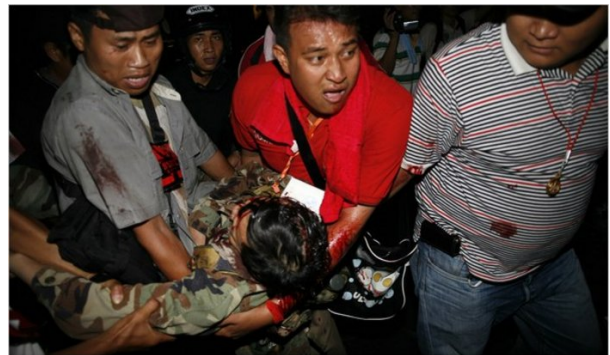
Seh Daeng shot

The sniper shooting of Seh Daeng, Maj. Gen. Khattiya Sawasdipol, on May 13, 2010 by an unknown assailant while chatting with foreign reporters has brought to rupture the standoff between Reds and Yellows in the heart of Bangkok and signals a new stage in the movement and its repression. Seh Daeng, whose nickname means “red commander”, was the reddest of the red shirts. His daughter, who sat at his bedside in the hospital until he succumbed to his grievous wounds on May 17, 2010, has been a staunch supporter of the yellow shirts, illustrative of the convoluted politics of the era. To better put in context the convoluted color-coded politics of the present day, and to identify some of the key heroes and villains and historic reference points being talked about on both sides of the barricades in Bangkok, a brief review of Thai political activism over the years will follow.