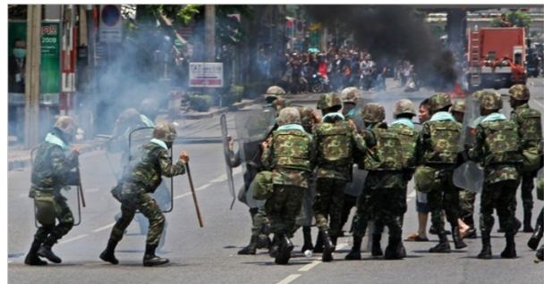
May 14, Thai forces move against protestors

As I write, the military has at last unleashed its terrible power and reports from Bangkok suggest the city is being turned into a bloody war zone.