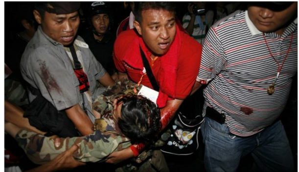
Seh Daeng shot

The sniper shooting of Seh Daeng, Maj. Gen. Khattiya Sawasdipol, on May 13, 2010 by an unknown assailant while chatting with foreign reporters has brought to rupture the standoff between Reds and Yellows in the heart of Bangkok and signals a new stage in the movement and its repression. Seh Daeng, whose nickname means “red commander”, was the reddest of the red shirts. His daughter, who sat at his bedside in the hospital until he succumbed to his grievous wounds on May 17, 2010, has been a staunch supporter of the yellow shirts, illustrative of the convoluted politics of the era. To better put in context the convoluted color-coded politics of the present day, and to identify some of the key heroes and villains and historic reference points being talked about on both sides of the barricades in Bangkok, a brief review of Thai political activism over the years will follow.