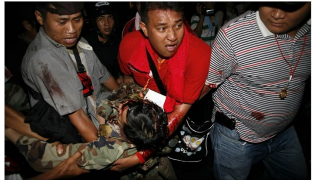
Seh Daeng shot

The sniper shooting of Seh Daeng, Maj. Gen. Khattiya Sawasdipol, on May 13, 2010 by an unknown assailant while chatting with foreign reporters has brought to rupture the standoff between Reds and Yellows in the heart of Bangkok and signals a new stage in the movement and its repression. Seh Daeng, whose nickname means “red commander”, was the reddest of the red shirts. His daughter, who sat at his bedside in the hospital until he succumbed to his grievous wounds on May 17, 2010, has been a staunch supporter of the yellow shirts, illustrative of the convoluted politics of the era. To better put in context the convoluted color-coded politics of the present day, and to identify some of the key heroes and villains and historic reference points being talked about on both sides of the barricades in Bangkok, a brief review of Thai political activism over the years will follow.