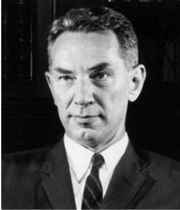
Edwin O. Reischauer

In the 1965 memo, Reischauer predicted correctly that reversion would be such a “politically important symbol” for Japan’s ruling conservative party (LDP) that the U.S. would not have to “give Japan any real say in the use of our bases.” In accepting U.S. conditions, the Japanese government ignited bitter protests in Okinawa, breaking its own oft-stated promise of a post-reversion Okinawa with military bases reduced “to mainland levels” ( hondo-nam ) and “without nuclear weapons” ( kaku-nuk ). What was officially called in Japan Henkan kyotei (Reversion Agreement) came to be known in Okinawa as “ henken kyotei ” (discriminatory agreement).