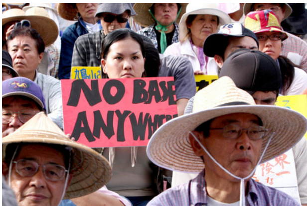
Anti-base demonstration, December 2009.

governments, developed a complex structure of persuasion and “buy-off” designed to neutralize, divide and defeat the anti-base citizen groups. Monies under a “Northern Districts Development” formula (tied to submission to the base project) were poured into Nago City and surrounding districts (80 billion yen in 2000 to 2009), filling the coffers of construction and public works-related groups and easing the fiscal crisis of local governments. At elections, the LDP made every effort to avoid a focus on the base issue, while stressing its ability to provide jobs and money. The resistance never gave up, however, and opinion surveys showed that support for their cause scarcely wavered.