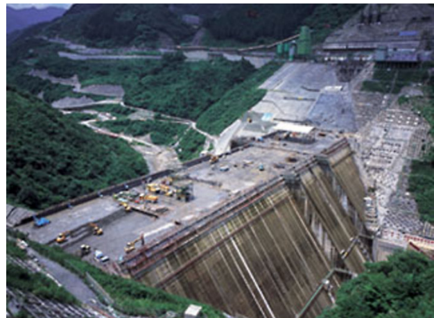
Takizawa Dam, second construction