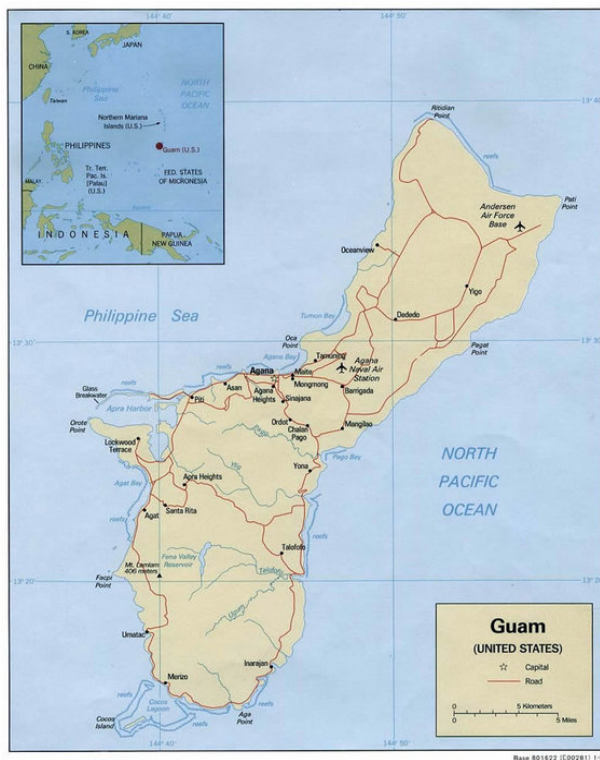
Map and location of Guam

station troops in countries including Japan, Korea, and the Philippines, but after the Cold War, there is no longer a need to station troops in each country, making Guam, located at nearly equal distances within 2000 nautical miles from Japan, Korea, Taiwan, Philippines, and Indonesia, an ideal place to set up a new integrated facility that would allow troops to be withdrawn from bases in Japan and Korea. (グアムの戦略地図 ( http://posts.same.org/JEETCE2007/presentations/2.3Bice.pdf ))