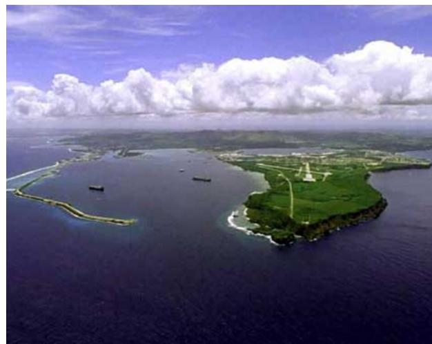
Apra Harbor on the West side of Guam

docking area will be newly constructed to allow for berthing facilities for the large amphibious assault ships that are now stationed at Sasebo: the USS Essex (LHD-2), the USS Juneau (LPD-10), the USS Germantown (LSD-42) and the USS Fort McHenry (LSD 43). Plans appear to be in the works to redeploy these ships from Sasebo to Guam. Moreover, it is likely that the 31st Expeditionary Force, consisting of the Marine combat and logistic units that, to prepare for emergencies, must stay near the landing craft, will also move to Guam from its base in Sasebo. (グアム米軍基地視察報告 2007年8月13日 ( http://www.city.ginowan.okinawa.jp/DAT/LIB/WEB/1/071030_0708013_mayor_2comment.pdf ))