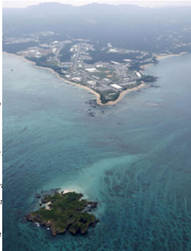
Cape Henoko and Camp Schwab, 2009