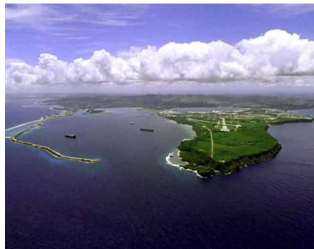
Apra Harbor on the West side of Guam

docking area will be newly constructed to allow for berthing facilities for the large amphibious assault ships that are now stationed at Sasebo: the USS Essex (LHD-2), the USS Juneau (LPD-10), the USS Germantown (LSD-42) and the USS Fort McHenry (LSD 43). Plans appear to be in the works to redeploy these ships from Sasebo to Guam. Moreover, it is likely that the 31st Expeditionary Force, consisting of the Marine combat and logistic units that, to prepare for emergencies, must stay near the landing craft, will also move to Guam from its base in Sasebo. (グアム米軍基地視察報告 2007年8月13日 ( http://www.city.ginowan.okinawa.jp/DAT/LIB/WEB/1/071030_0708013_mayor_2comment.pdf ))