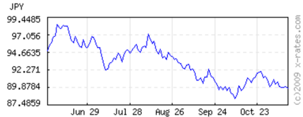
Yen to US$ exchange rate

the yen while the prices of Japanese government bonds (“JGB’s”) would be tumbling (i.e., yields would be rising). I am no adherent of efficient markets reasoning (in a nutshell, according to that reasoning, prices can't be wrong – they tell us everything we can possibly know at any particular moment about the future), but given that most of the doomsayers generally subscribe to orthodox free market economics, they have some explaining to do. An investor who genuinely believes the Japanese government is going to default on its debt or that Japan will find itself in some intractable economic squeeze is not going to wait until these things actually happen to sell holdings of JGBs or short the yen. Indeed, an investor who is completely convinced these events are inevitable can make out like a bandit by placing large bets against the yen and JGBs. That's the whole point behind the efficient markets hypothesis – that if enough investors believe the yen and the JGBs are headed for steep falls, then they will by their very actions bring these on. And if they haven't, well then, there is somebody somewhere who has convinced himself of a very different scenario. Who is right? We don't know, but the efficient markets hypothesis will tell you that for the moment, more investors believe the yen and the JGB are sound than otherwise.