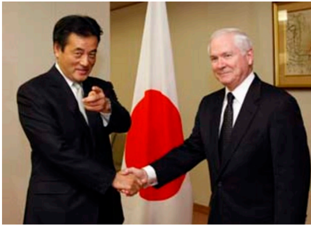
Okada (left) and Gates

of an “equal partnership” with the U.S. based on Japan’s national “independence.” When Robert Gates, the U.S. Secretary of Defense, visited Japan in late October, he pressed Okada and Kitazawa Katumi, the Minister of Defense, to make sure that Japan’s official investigation of the secret deals would not harm the U.S. policy of nuclear deterrence and the U.S. – Japan relationship.