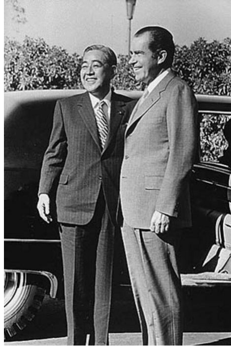
President Richard M. Nixon and Japanese Prime Minister Eisaku Sato meeting at the Western White House in San Clemente, California in January 1972. Nixon and Sato worked out the final details of the Okinawa reversion agreement during these meetings.

The two secret agreements were negotiated during the Cold War, when the United States Navy routinely transited Pacific waters with nuclear weapons onboard and the possibility of a U.S.-Soviet nuclear war was a matter of routine military planning. One of the agreements was actually a record of discussion that established an agreed and carefully defined interpretation of U.S. commitments regarding nuclear weapons, negotiated in 1960, that allowed transit of nuclear weapons through Japanese territory and waters, relegating the consultation requirement to the introduction and basing of nuclear weapons in Japan. The other was part of the 1969 agreement reverting Okinawa to Japan: U.S. nuclear weapons on Okinawa would be withdrawn but re-introduction would be possible in an emergency. Even after the end of the Cold War, which brought the worldwide withdrawal of all U.S. theater nuclear weapons, the U.S. government deferred to the Liberal Democrats on the need to keep the agreements secret, but that need is clearly now moot. Declassification is possible and necessary because determining what Tokyo and Washington actually negotiated is a question of significant historical importance and a key missing piece in the nuclear history of the Cold War.