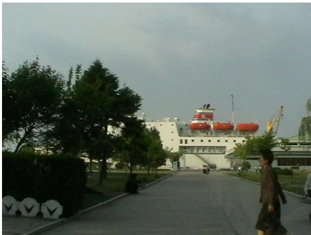
The ferry Mangyongbong 92, lying idle in the North Korean port of Wonsan, May 2009

recent years, the general mood of fear and hostility towards North Korea has made it particularly difficult for Koreans with family links to the DPRK to maintain those connections, and ironically even means that the small number of former “returnees” who have managed to escape North Korea as refugees and return to Japan since the 1990s find it necessary to conceal their backgrounds for fear of attracting suspicion and discrimination.