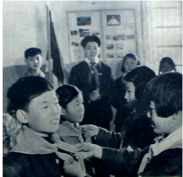
Newly-arrived Korean children from Japan in the DPRK, as depicted in a North Korean publication

very close cooperation between Sōren , local governments and the Red Cross (as well as the fact that Sōren had been deeply infiltrated by police informers), it is inconceivable that Red Cross and government officials were unaware of it.