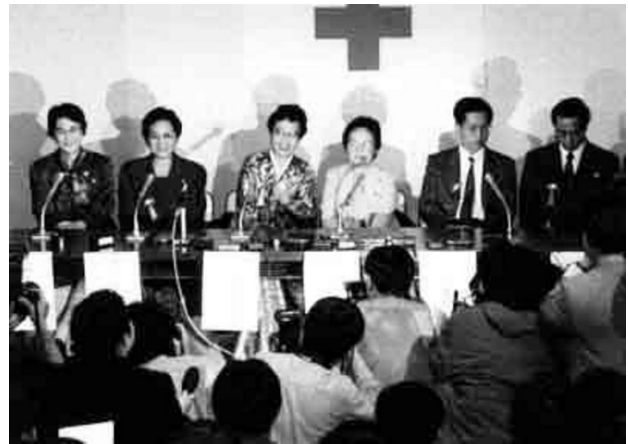
Members of the first group of “Japanese Wives” to be allowed to make a visit to Japan speak at a press conference at Narita Airport, Nov. 1997

broadening the scope of communications between the two countries. A particularly important part in these discussions was played by the Japanese and North Korean Red Cross Societies, who (as we have seen) played central roles in the original mass migration. On 10 September 1997, the two societies reached agreement on the “Japanese wives” issue, and one month later (and unmistakably as a quid pro quo ) the Japanese government announced its major commitment of aid to famine-stricken North Korea via the World Food Program and ICRC. 37