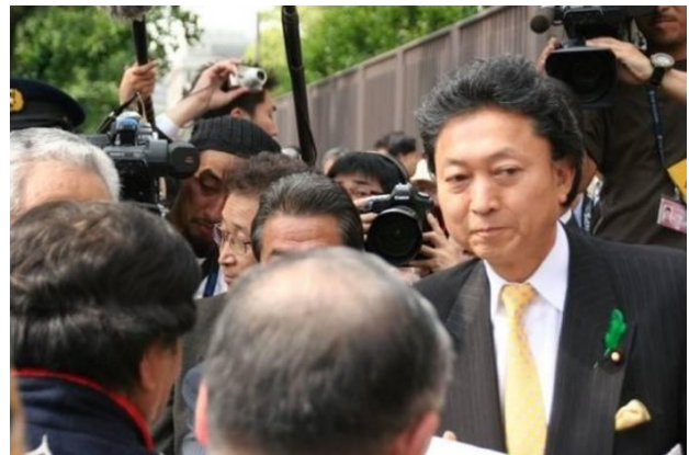
Suzuki Muneo in Ainu garb and Hatoyama Yukio greeting marchers during the May demonstration, a month prior to indigenous recognition.

In spite of the packaging, at base, however, there has been very little difference between the structure of these recent developments and those which led to the creation of the Ainu Cultural Promotion Act more than ten years ago 24 . The political meanderings that set the stage for the drafting of that Act took place during the 1990s realignment of Japanese politics, in which the LDP lost power for the first time in the postwar