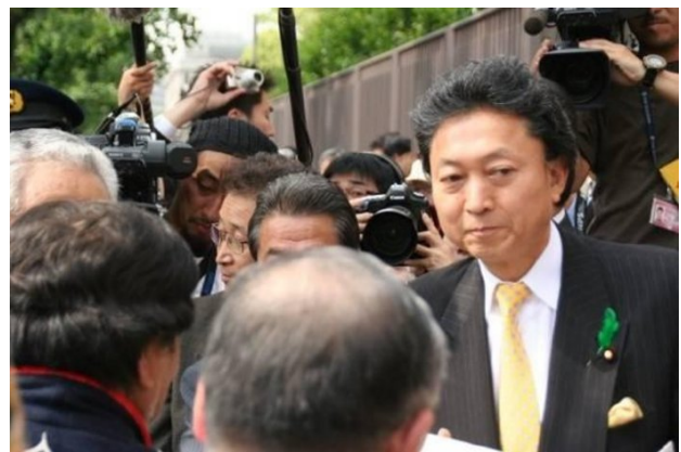
Suzuki Muneo in Ainu garb and Hatoyama Yukio greeting marchers during the May demonstration, a month prior to indigenous recognition.

In spite of the packaging, at base, however, there has been very little difference between the structure of these recent developments and those which led to the creation of the Ainu Cultural Promotion Act more than ten years ago 24 . The political meanderings that set the stage for the drafting of that Act took place during the 1990s realignment of Japanese politics, in which the LDP lost power for the first time in the postwar