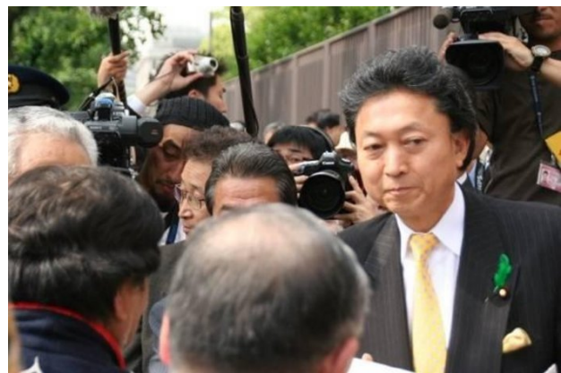
Suzuki Muneo in Ainu garb and Hatoyama Yukio greeting marchers during the May demonstration, a month prior to indigenous recognition.

In spite of the packaging, at base, however, there has been very little difference between the structure of these recent developments and those which led to the creation of the Ainu Cultural Promotion Act more than ten years ago 24 . The political meanderings that set the stage for the drafting of that Act took place during the 1990s realignment of Japanese politics, in which the LDP lost power for the first time in the postwar