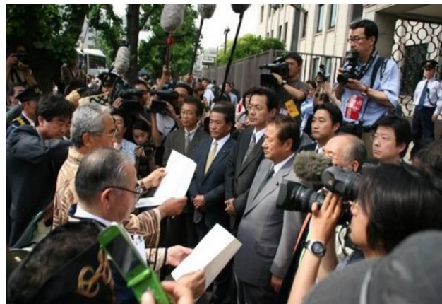
The chairman and directors of the Hokkaido Utari Kyōkai present demands to Hokkaido politicians during a demonstration on 22nd May 2008

kind redistribution of resources that might take place as a result. In other words, it is concerns over the status of state sovereignty that are at issue. This is why, for an equal number of years, organizations like the Hokkaido Utari Kyōkai (now renamed the Hokkaido Ainu Kyōkai, or known by its English name, the Ainu Association of Hokkaido) have repeatedly stated that they are not interested in land redistribution, or any kind of state-like independence. As the official channel between the state and Ainu affairs to date, as well as being the largest organization representing Ainu in Hokkaido, the demands of the Kyōkai, originally mapped out in their Draft Law Concerning the Ainu People of 1984 12 , have been consistently tame and concentrated on educational scholarships and employment assistance in an effort to better the living standards of its members 13 .