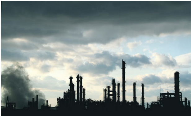
Air pollution in Osaka

robust emissions reductions is a repudiation of former PM Aso Taro's much-ridiculed June 10 announcement of a 15% cut by 2020 (from 2005 emissions levels, or a mere 8% cut from 1990 levels). Hatoyama's target will become yet more formal on September 22 in New York, when he repeats it to the UN's first-ever formal meeting specifically devoted to climate change.