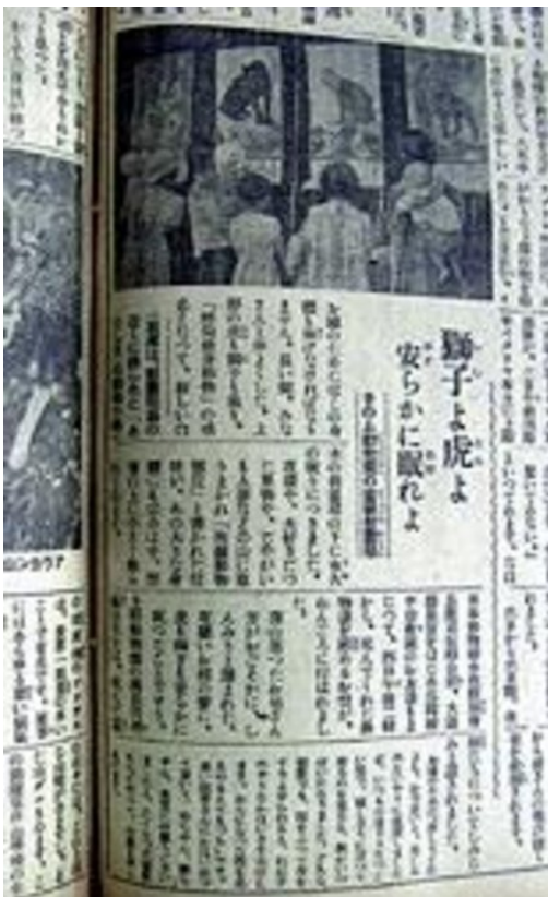
A newspaper for children, the “Shōkokumin shinbun”, reports on the memorial service

On September 2, the metropolitan government officials sent a notice to newspapers about the “disposal” of the wild beasts at Ueno Zoo and the intention to hold a memorial service ( ireisa ) for them on September 4 (Ueno, 1982a, 177). This event was not only attended by several high-ranking Tokyo officials, among them the governor himself, but also by hundreds of school children, who had been specifically targeted as an audience (Hasegawa, 2000, 23).