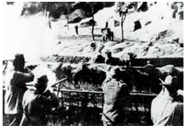
Lions are shot at Higashiyama Zoo in 1944

After an American air attack on December 13, 1944, however, he had to concede. In accordance with an order by the Ministry of Home Affairs, military personnel and police shot seven lions, tigers, bears and leopards within 45 minutes. A few days later, another eight bears were killed (Senjika no dōshokubutsuen, n.d.).