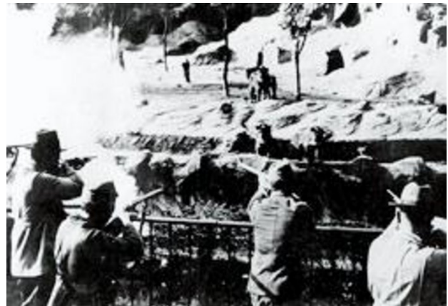
Lions are shot at Higashiyama Zoo in 1944

After an American air attack on December 13, 1944, however, he had to concede. In accordance with an order by the Ministry of Home Affairs, military personnel and police shot seven lions, tigers, bears and leopards within 45 minutes. A few days later, another eight bears were killed (Senjika no dōshokubutsuen, n.d.).