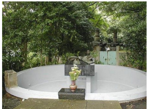
The new memorial (erected in 1975) for animals that died in Ueno Zoo

And the animals themselves? They were reduced to objects to be used for propaganda, especially directed at children. And their deaths continue to be used for propaganda aimed at children, this time for “peace”. Often depicted in harrowing detail, yet deeply sentimentalized, their story is meant to show how horrible war can be (e.g., Tsuchiya & Takebe, 2009).