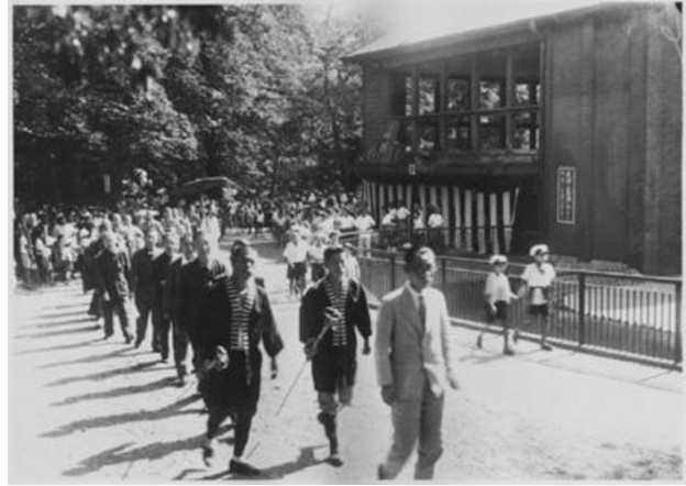
The memorial service on September 4, 1943; notice the striped bunting

Two further points need to be made: The memorial service for the slaughtered animals—including all three elephants!—on September 4 was held while Hanako and Tonky were still starving—literally a stone's throw away. The elephant house had been covered at that time with a striped bunting (Ueno, 1982a, 177).