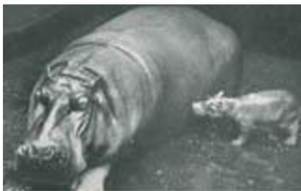
Kyōko and her child