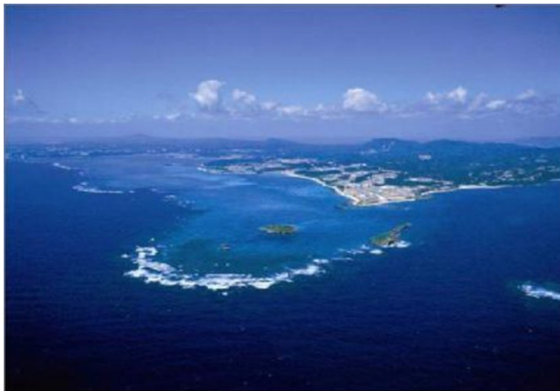
Cape Henoko (including Camp Schwab base),

The U.S. Marine Futenma Air Station, surrounded by a thickly populated district, is located so close to the residential area that it would not clear US safety standards under Air Installation Compatible Land Use Zone (AICUZ). Donald Rumsfeld, when Secretary of Defense, visited this area and pointed out the danger. Therefore, taking the opportunity of the rape incident in 1995, the SACO (Special Action Committee on Okinawa) decided the base should be relocated to Henoko, reaching agreement in December 1995 supposedly to "reduce the burden of Okinawa". The helicopter crash occurred in 2004 (one year after the deadline for relocation under the SACO final agreement) but before Futenma Air Station was relocated, proving that the location of the base was dangerous.