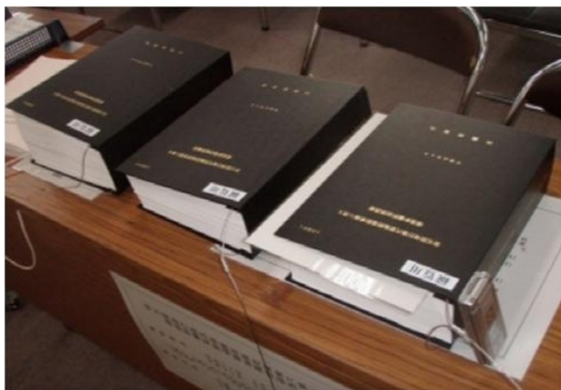
The Draft EIA Report, 5,400 pages

The Henoko environmental impact assessment (EIA) has, at least in form, been steadily moving ahead. On 1 April 2009, an enormous, 5,400 page draft EIA report was tabled. However, in many respects the Henoko EIA contravened the intention of the EIA Law. As a member and councilor of the Japan Society for Impact Assessment, I cannot acknowledge this as a true EIA. Due to space limitations, I will indicate just four points that are crucial violations of the EIA Law.