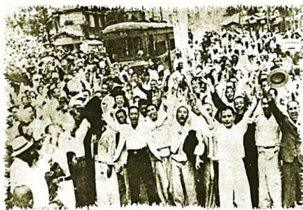
Koreans celebrate independence on August 15, 1945

The August 15, 1945 announcement by the Japanese Emperor declaring Japan's intention to accept the Allied forces' terms of unconditional surrender sent Koreans throughout the empire into the streets in celebration. For the first time in decades they could freely associate with their fellow countrymen, communicate in their native language, and wave their national flag ( taegeukgi ) as Koreans without fear of punishment.[1]